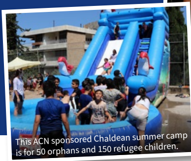
This ACN sponsored Chaldean summer camp is for 50 orphans and 150 refugee children.