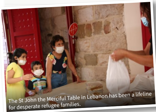
The St John the Merciful Table in Lebanon has been a lifeline for desperate refugee families.

The St John the Merciful Table is a key ACN project, providing one nutritious hot meal a day, every day of the year, serving 1,500 people. The majority are families with children and young people who lost everything when they fled Syria and who urgently need help. ACN is helping with rent, food and other basics for families like these to help them survive with dignity.