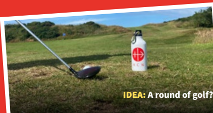
IDEA: A round of golf?

As an extra bonus, whatever you raise will be matched.