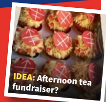
IDEA: Afternoon tea fundraiser?

As an extra bonus, whatever you raise will be matched.