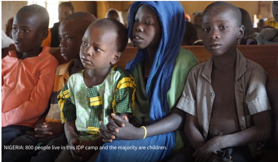
NIGERIA: 800 people live in this IDP camp and the majority are children.

accommodation, reliant on charity for day-to-day essentials, missing out on stability and education – the only real way to escape long-term poverty. Often suffering from PTSD, the physical, emotional, psychological and spiritual impact on children and young people is immense. Their faith is their hope and strength.