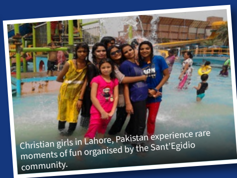
Christian girls in Lahore, Pakistan experience rare moments of fun organised by the Sant'Egidio community.