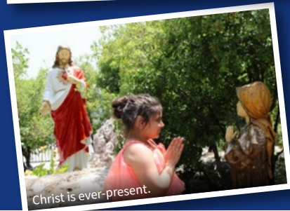
Christ is ever-present.