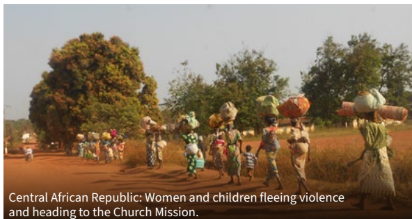
Central African Republic: Women and children fleeing violence and heading to the Church Mission.