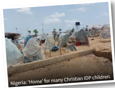
Nigeria: 'Home' for many Christian IDP children.

Please join Aid to the Church in Need to make a huge difference for suffering and displaced children and young people around the world who have lost their homes, their future and sometimes their family members, just for being Christian.