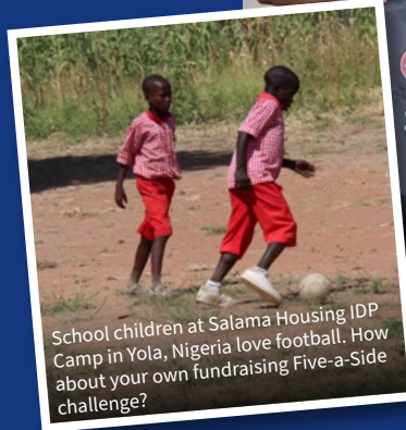
School children at Salama Housing IDP Camp in Yola, Nigeria love football. How about your own fundraising Five-a-Side challenge?