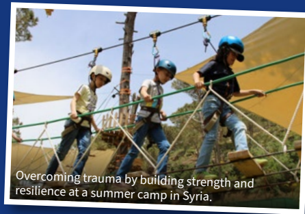
Overcoming trauma by building strength and resilience at a summer camp in Syria.