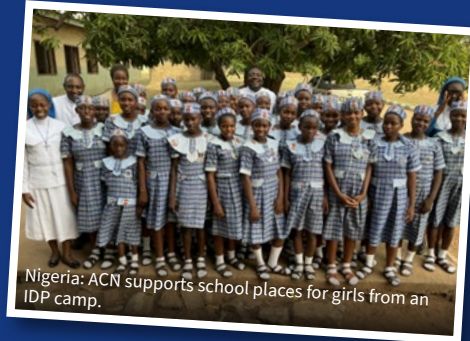
Nigeria: ACN supports school places for girls from an IDP camp.