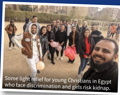
Some light relief for young Christians in Egypt who face discrimination and girls risk kidnap.