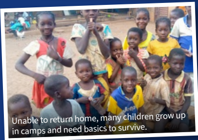
Unable to return home, many children grow up in camps and need basics to survive.