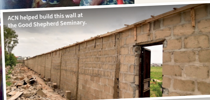
ACN helped build this wall at the Good Shepherd Seminary.