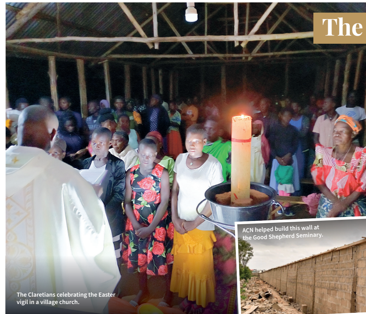
The Claretians celebrating the Easter vigil in a village church.

“There is no doubt having the New Testament and Psalms will go a long way to improve the Kambari people’s understanding of the scripture and thereby improve their faith journey... We would be very grateful if Aid to the Church in Need will come to our assistance with this important and worthy project.” ✚