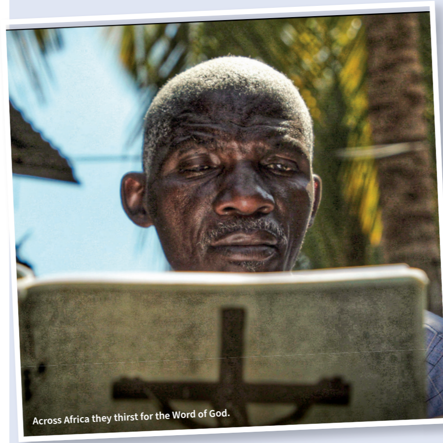
Across Africa they thirst for the Word of God.