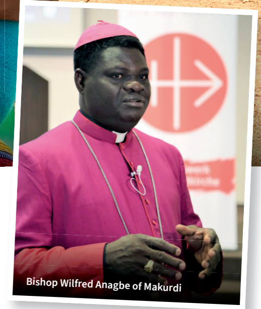
Bishop Wilfred Anagbe of Makurdi

Inside you will read how your generous love is supporting our brothers and sisters in Christ, not only where they are bearing the brunt of the violence, but also where