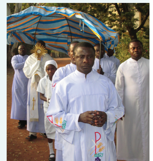
Seminarians in Nigeria take part in a Blessed Sacrament procession

Testament – it took 2,000 years to bring the Gospel to the people.”