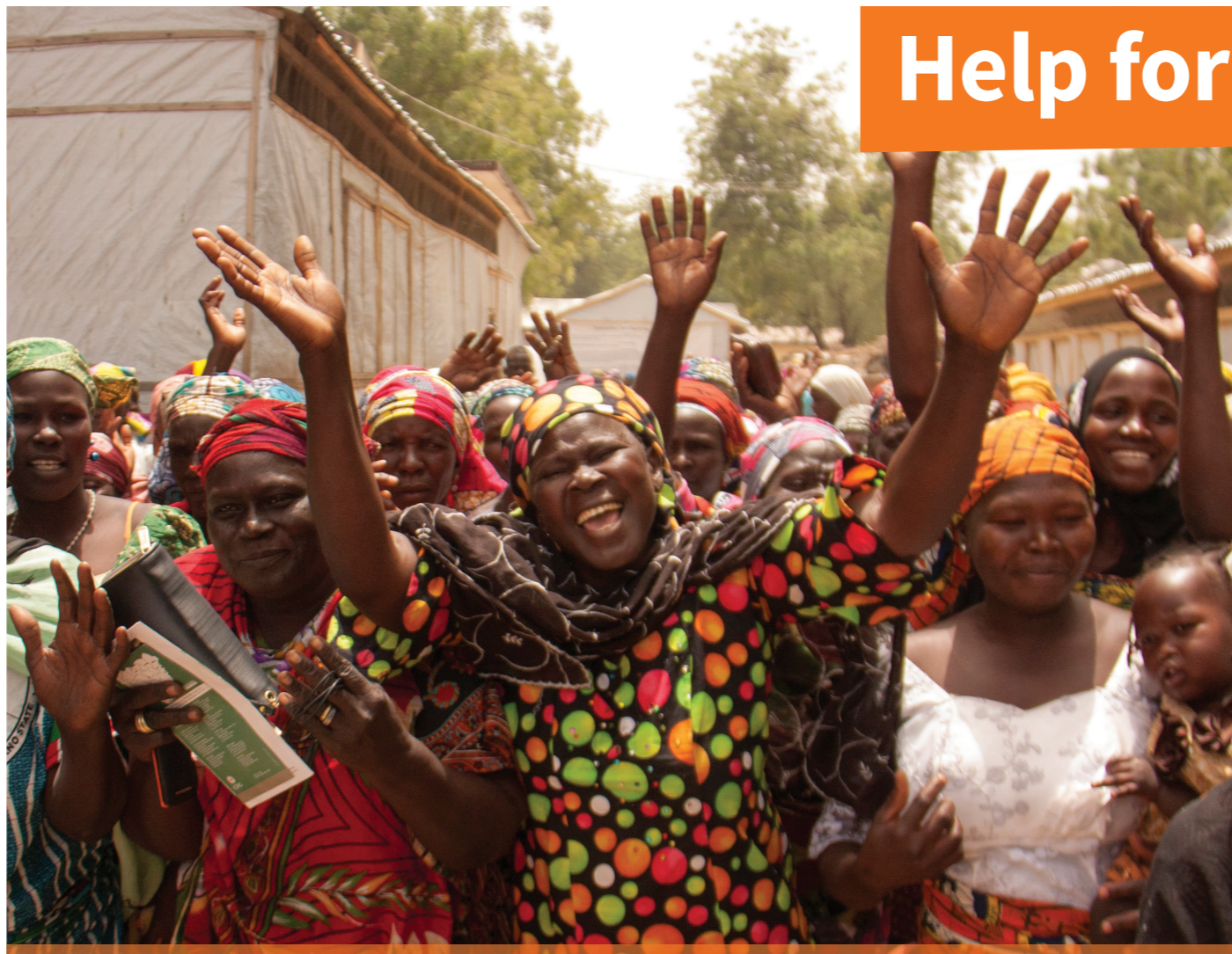
Despite their suffering, women keep faith and hope at a displacement camp in Maiduguri