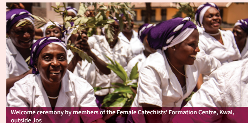
Welcome ceremony by members of the Female Catechists’ Formation Centre, Kwal, outside Jos

They have embraced God’s directive in Jeremiah (31:13) to “rejoice in the dance”. God promised the faithful: “I will turn their mourning into joy, I will comfort them, and give them gladness for sorrow.”