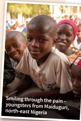
Smiling through the pain – youngsters from Maiduguri, north-east Nigeria

Please remember the faithful in your prayers.