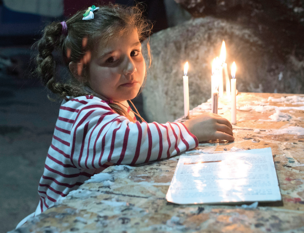
Keeping the flame of hope burning: A little girl lights a candle at a Christian displacement camp in Erbil, northern Iraq

In countries all around the world, Christians live in fear of their lives because of the faith we all hold dear.