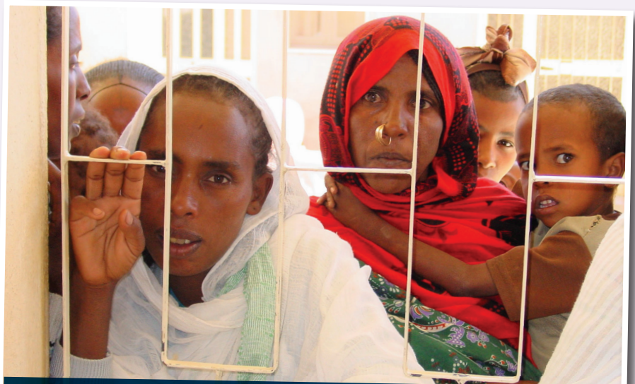
Christian women in Eritrea face the very real threat of incarceration and torture

Aid to the Church in Need is helping thousands of people who have escaped persecution and who urgently need food,