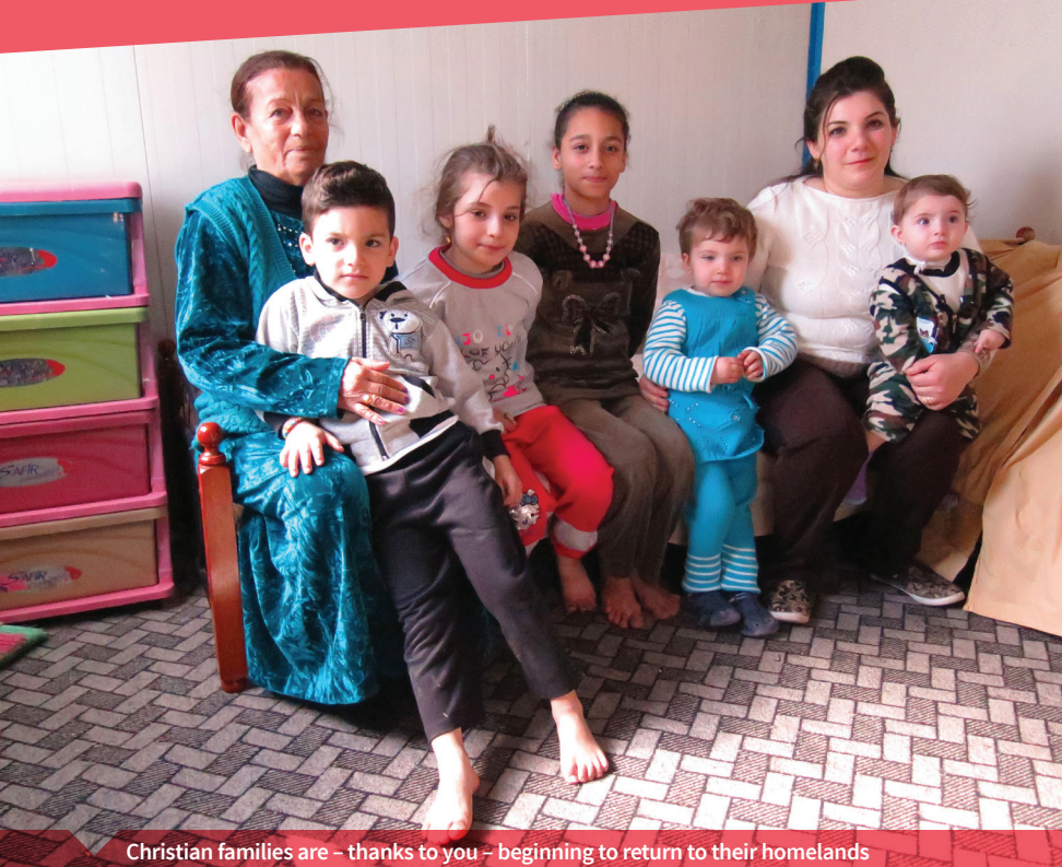
Christian families are – thanks to you – beginning to return to their homelands

Please help ACN rebuild homes for families wanting to return to their ancient Christian homelands in the Nineveh Plains of northern Iraq. ✝