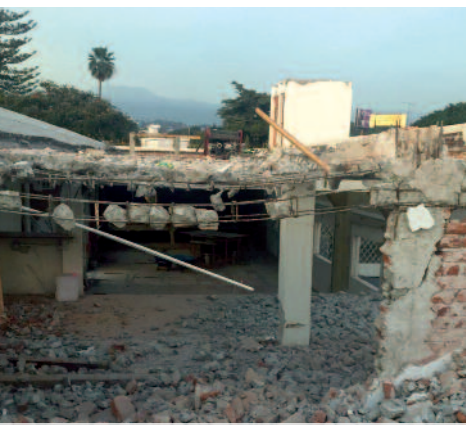
After the earthquake: parts of the convent had to be demolished for safety.

Urge que Cristo reine - "Make haste, that Christ may reign", is the motto of the congregation, which is also present in many other countries, including challenging ones like Indonesia and Sierra Leone. But love urges them on. So many souls are waiting for the Sisters. But they need to rebuild these walls, which once offered protection and a place to recover new strength in silence and seclusion, for their wide-ranging task of evangelisation. The plans for the renovation work have been drawn up, and work has already begun. We share their sense of urgency, and are giving £44,000 to raise new walls for the mother house of the Poor Clares in Cuernavaca.