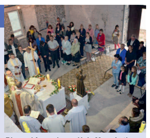
Blessed from above: Holy Mass in the chapel of Padre Pio – it is already full and soon it will be beautiful.

But the little flock fought back. The faithful kept faith and prayed to Padre Pio, the patron saint of their parish in Zaporyzhzhya, Ukraine . They wanted to be able to go to Confession, attend Holy Mass, hold exposition and adoration of the Blessed Sacrament. And their pastors were won over. In 2008 the missionaries of La Salette returned and stayed on. But they still had no chapel – so they converted a room in a house to serve as a temporary chapel – far too small and far too cramped. Then they bought an old house, a former bakery. It had to be extensively rebuilt, as a ruin is not a fitting house of God. Now the ruin has become a building site. But the parish continues to grow. Moreover, this year is the 50th anniversary of Padre Pio's death, so the new structure, in which Holy Mass is already being celebrated, needs to become a proper, beautiful chapel by then. Impressed by this small miracle of perseverance, we have promised further help amounting to £26,400.