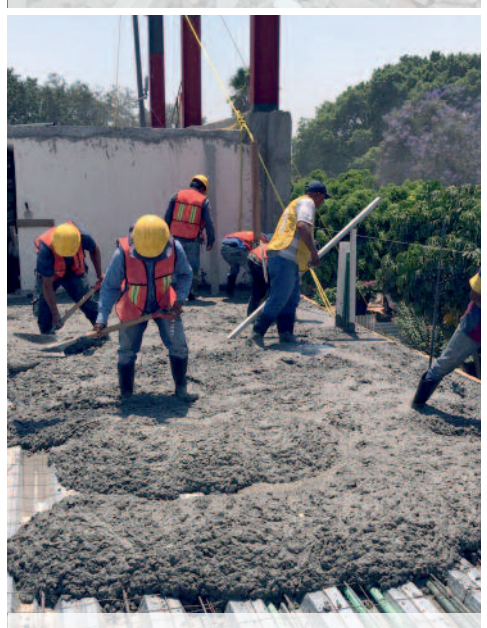
Urged on by love: work has already begun on the new house.