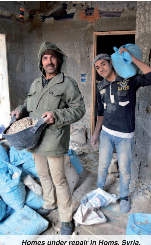
Homes under repair in Homs, Syria.