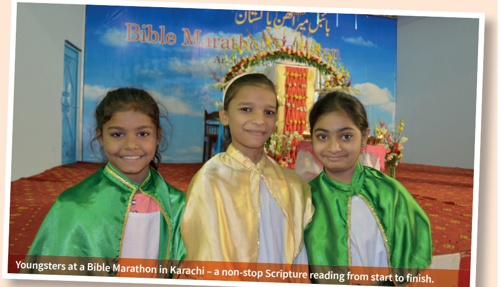
Youngsters at a Bible Marathon in Karachi – a non-stop Scripture reading from start to finish.