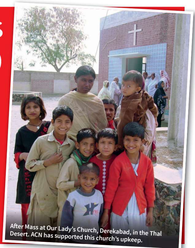
After Mass at Our Lady's Church, Derekabad, in the Thal Desert. ACN has supported this church's upkeep.