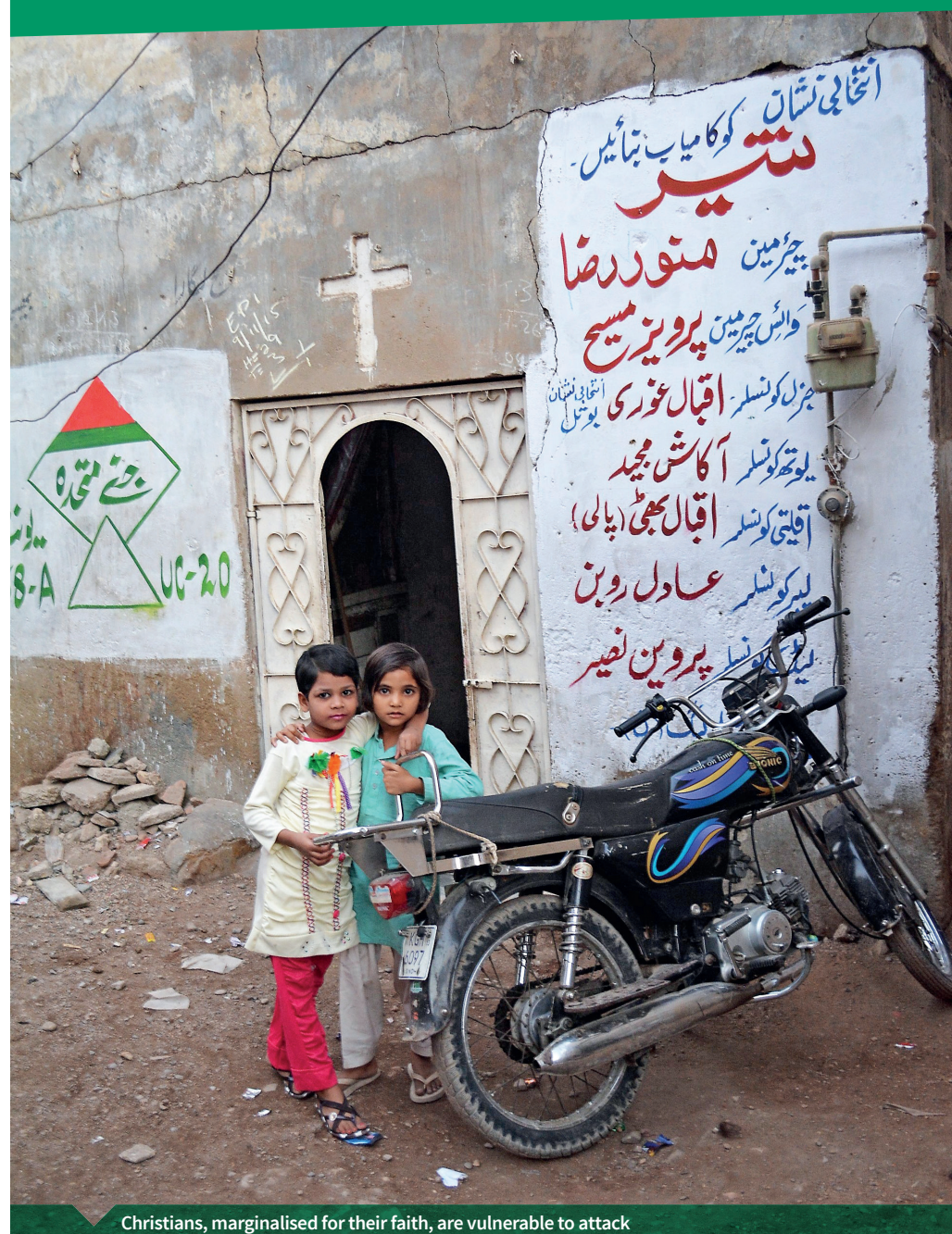
Christians, marginalised for their faith, are vulnerable to attack

Thanks to you, Aid to the Church in Need is helping Christians on death row in Pakistan and others accused of crimes they did not commit.