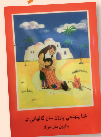
ACN Child's Bible

For young Christians in Pakistan, ACN's Child's Bible is a treasured gift that introduces them to the wonder of the Scriptures and the sacred role God plays in all our lives.