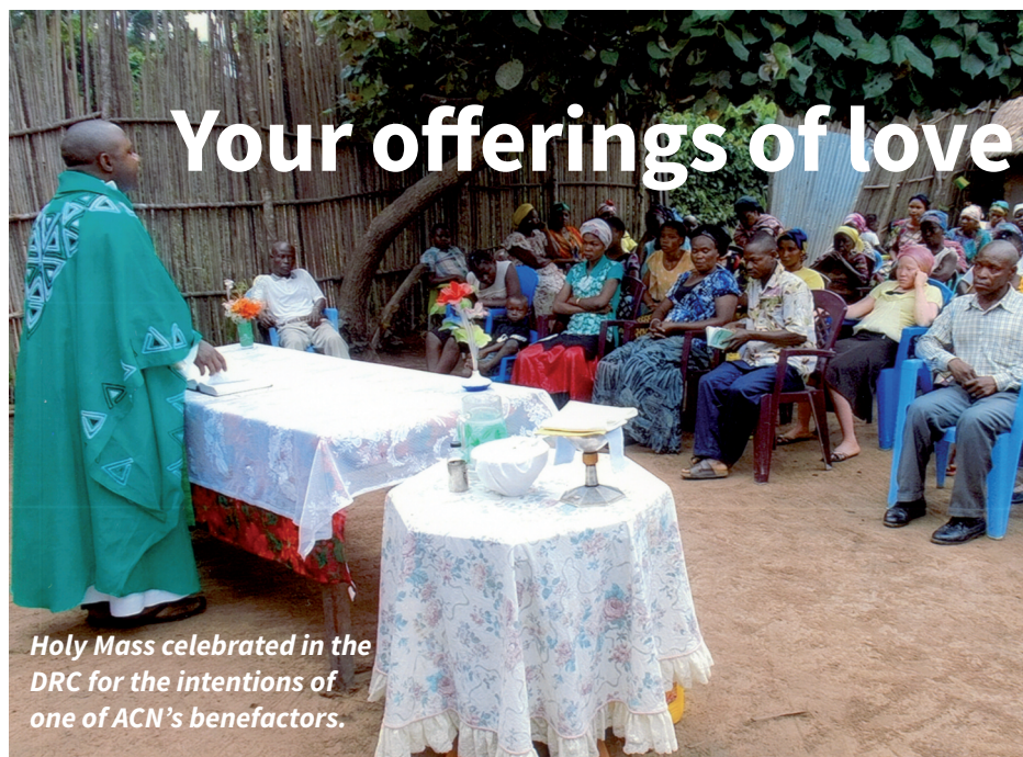
Holy Mass celebrated in the DRC for the intentions of one of ACN's benefactors.

A Mass stipend, or Mass offering, is a gift of money to a priest, in return for which he agrees to celebrate Holy Mass for a particular intention of the donor. The grace of the Sacrament cannot be "bought" in this way, but the stipend does bind the giver more intimately with the Holy Sacrifice of the Mass. This custom dates back to the second century. The acceptance, administration and application of Mass stipends is governed by canons 945 – 958 of the Code of Canon Law. The diocesan bishop is responsible for overseeing their observance.