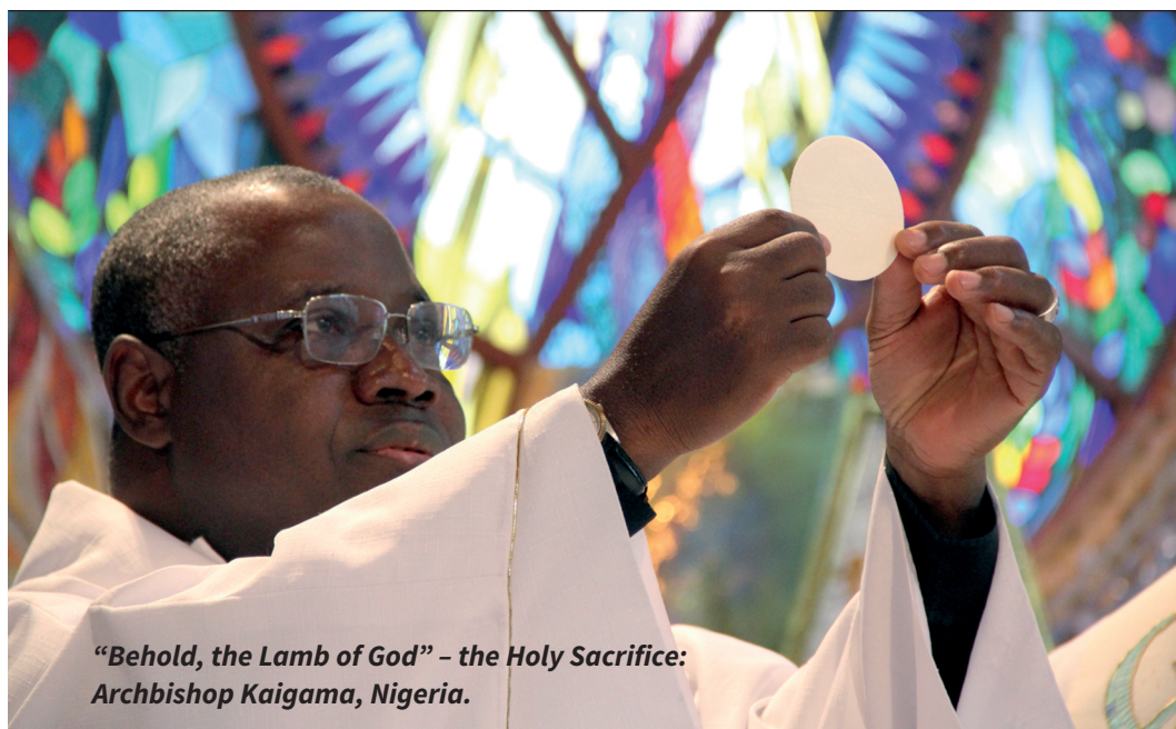
“Behold, the Lamb of God” – the Holy Sacrifice: Archbishop Kaigama, Nigeria.

No 7 • October/November 2018 Published eight times per year