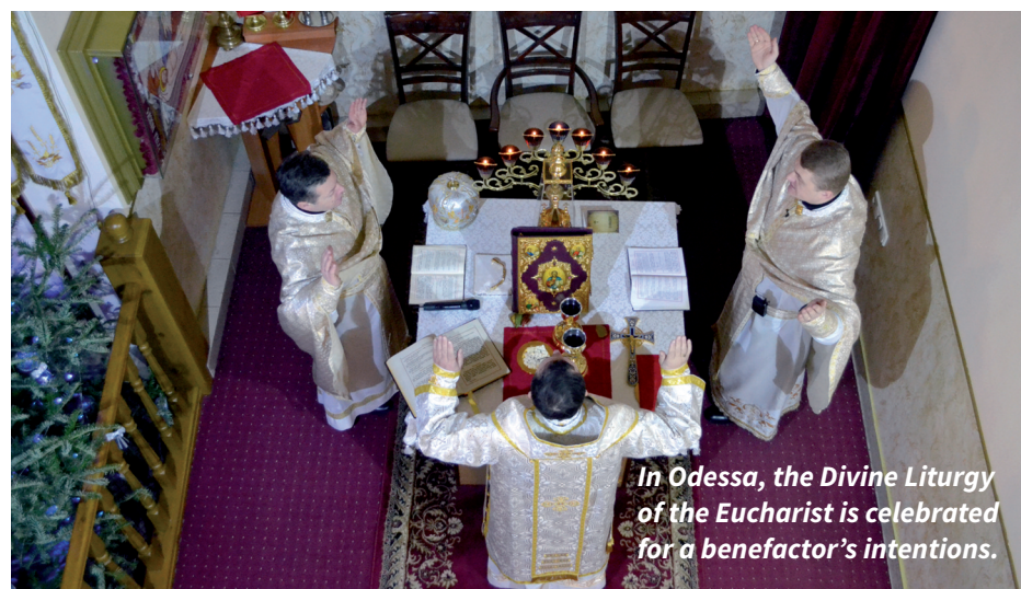
In Odessa, the Divine Liturgy of the Eucharist is celebrated for a benefactor's intentions.

stitions leading many Christians astray, Catholic priests struggle to draw people back to God. But you are helping, with 2,400 Mass offerings this year. That is 2,400 encounters with Christ. In the Ukrainian Greek-Catholic Exarchate of Odessa we have passed on 1,000 Mass stipends to 43 priests. Again, it is not only the priests you are supporting here but also their vital pastoral work. We cannot be closer to God than in the Holy Eucharist, and your generous stipends help bring the world closer to God.