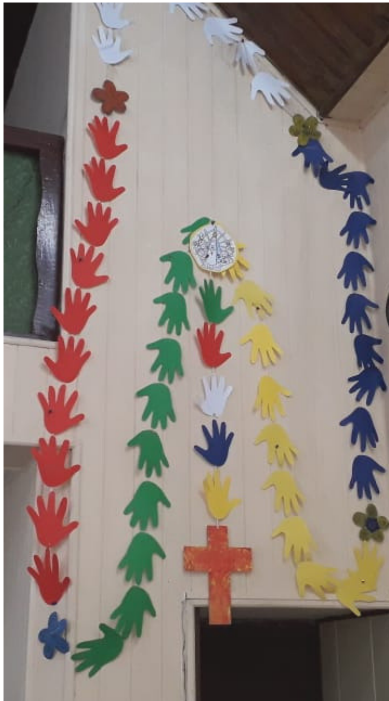
Paper Hand Rosary