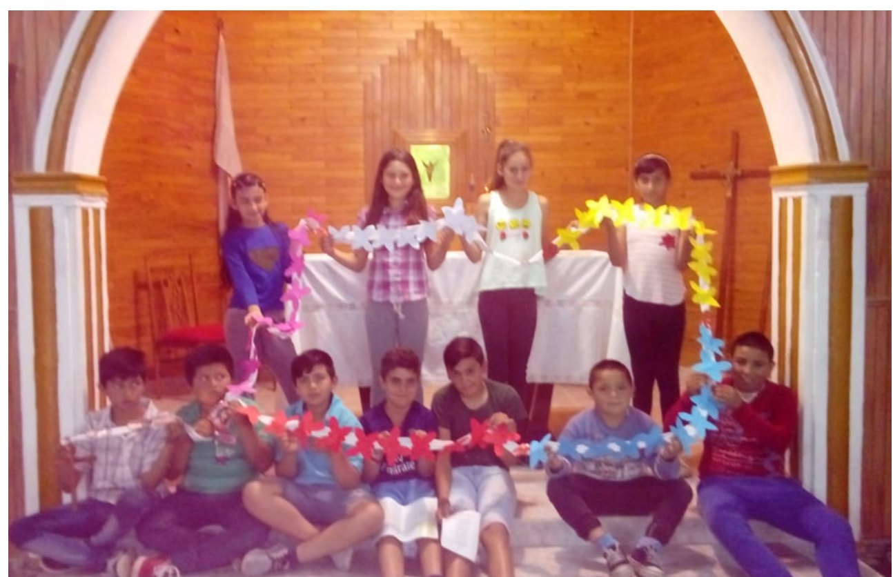
Paper Flower Rosary