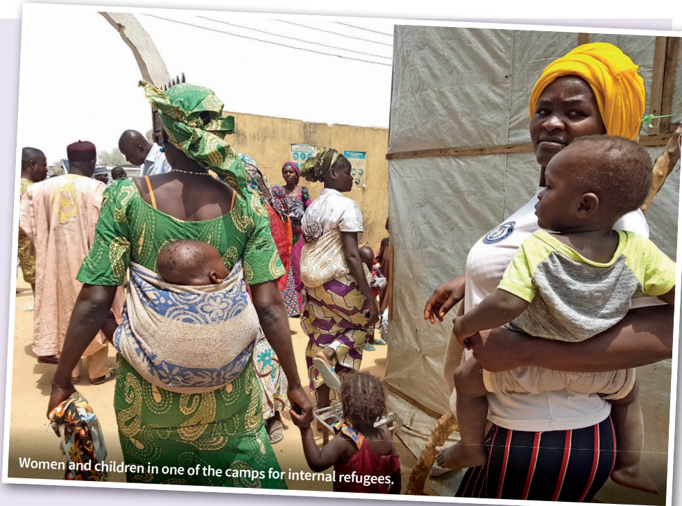
Women and children in one of the camps for internal refugees.