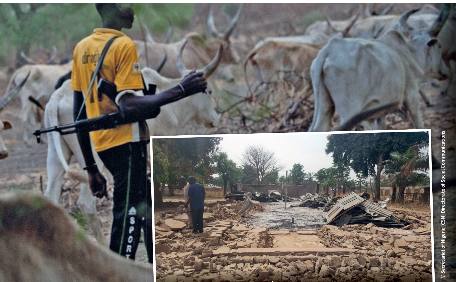
A village in Kaduna destroyed by Fulani attacks.