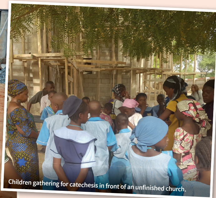
Children gathering for catechesis in front of an unfinished church.