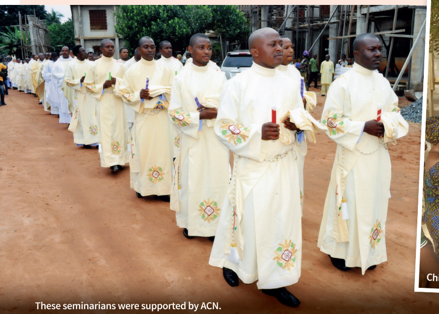
These seminarians were supported by ACN.

those in the Archdiocese of Benin City. Despite all the difficulties Nigeria's Christians are experiencing, your generous love is helping a Faith under fire to flourish. ✝