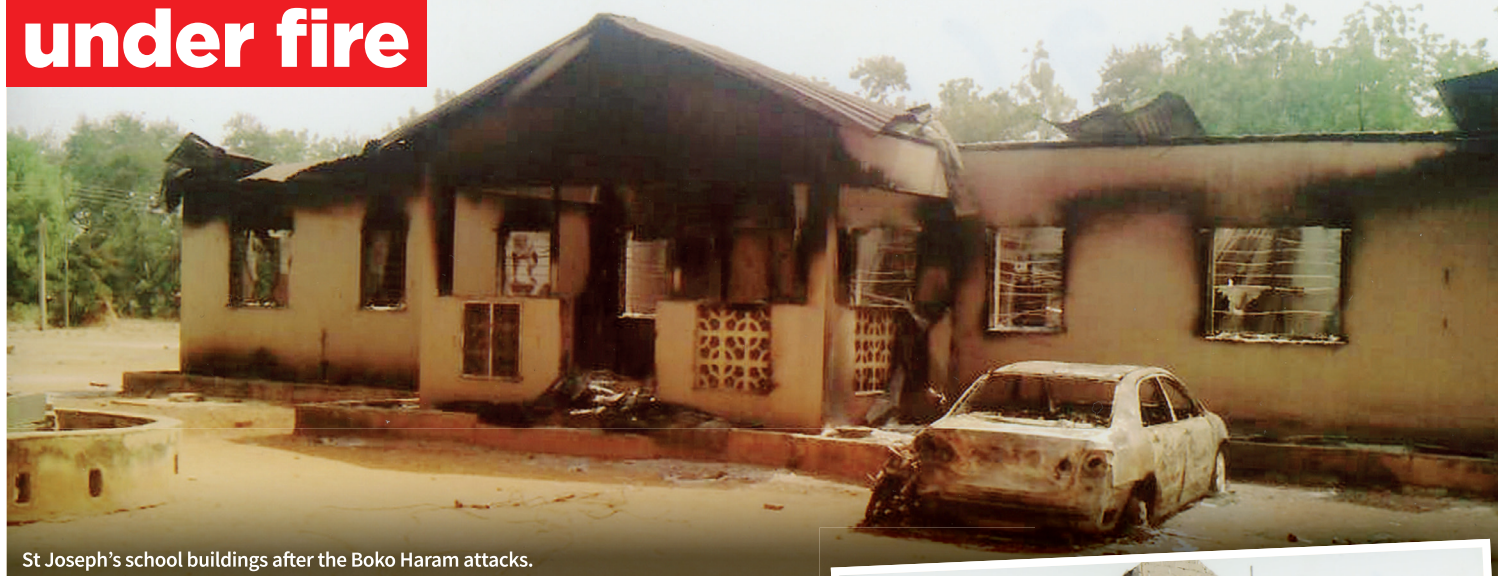
St Joseph's school buildings after the Boko Haram attacks.

St Joseph's School in Shuwa was attacked and destroyed by Boko Haram – but ACN is helping to rebuild.