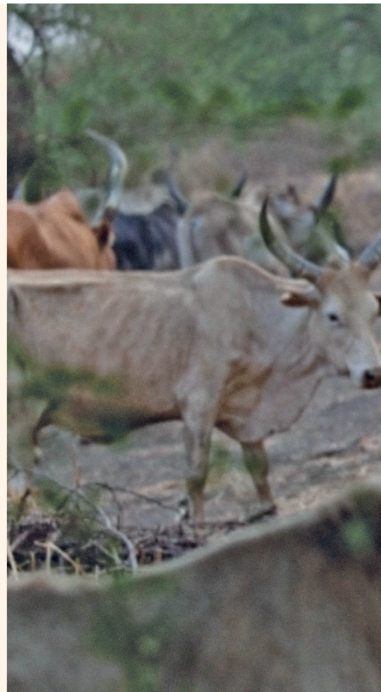
A Fulani cattle herder armed with a rifle.

Only through your ongoing gifts of love were we able to help our suffering brothers and sisters in their time of need. God bless you for your love. 🙏