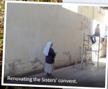
Renovating the Sisters' convent.

With Eritrea's priests and Sisters facing severe restrictions on travelling abroad to study, Aid to the Church in Need has offered to help with their training.