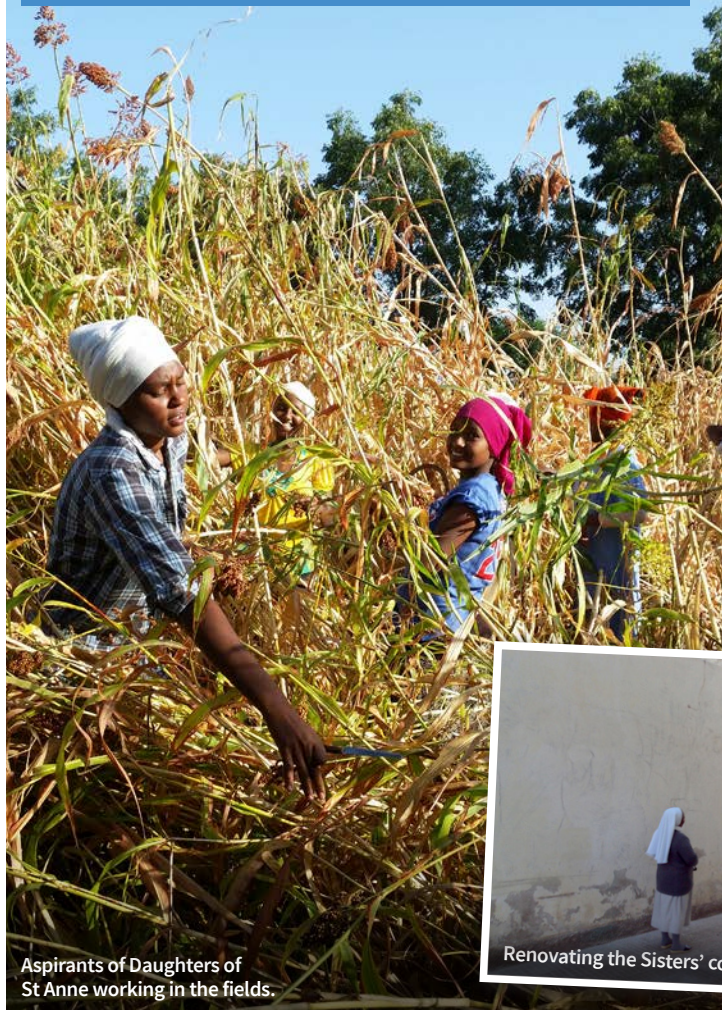
Aspirants of Daughters of St Anne working in the fields.