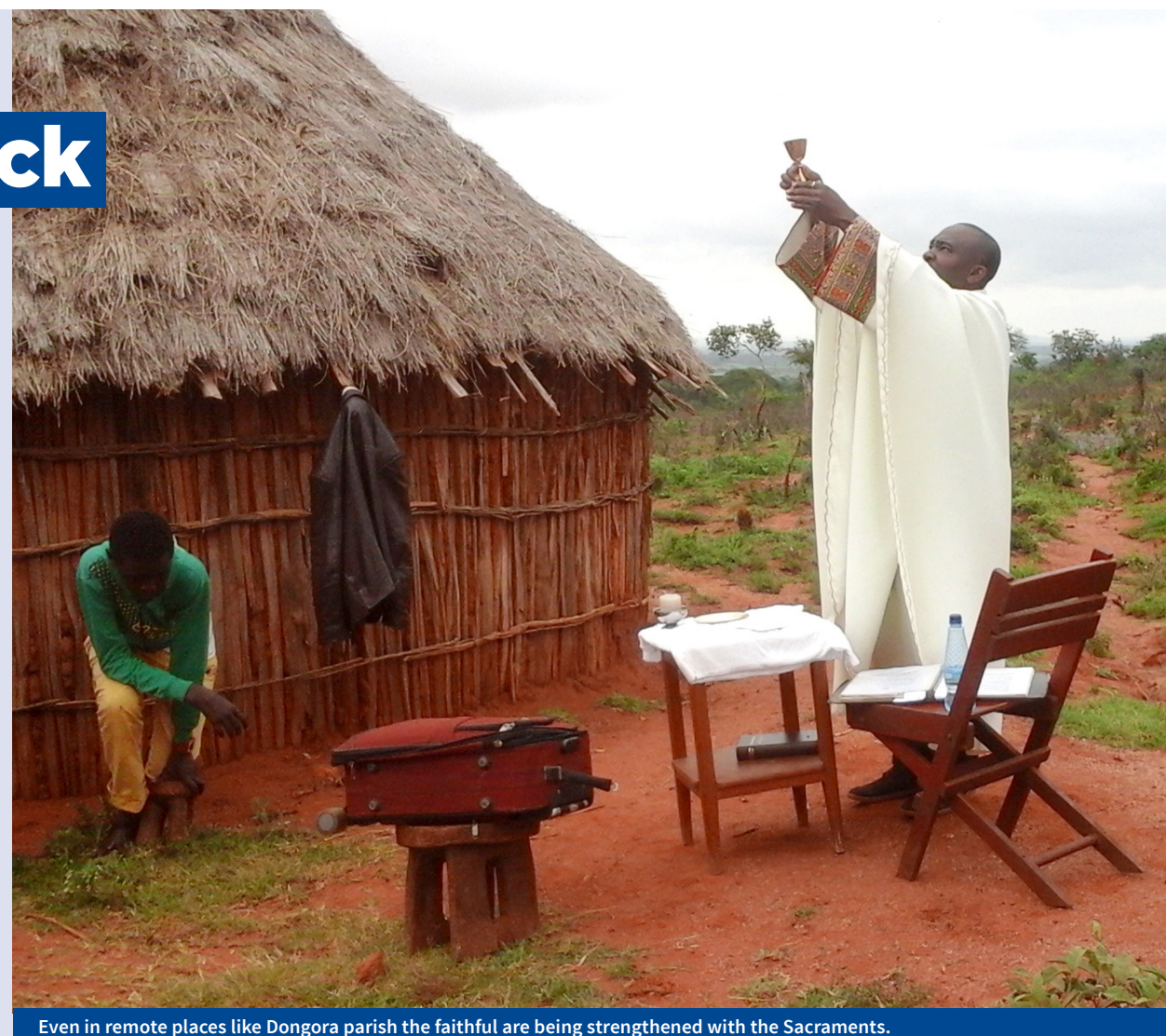
Even in remote places like Dongora parish the faithful are being strengthened with the Sacraments.