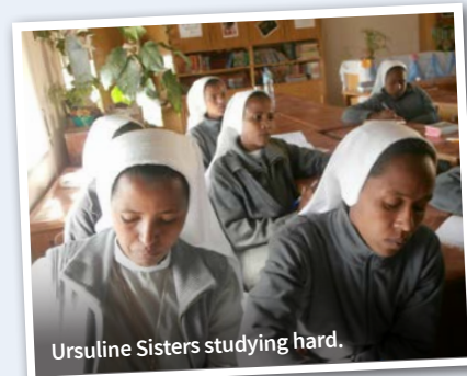
Ursuline Sisters studying hard.

The Provincial Superior said: "Once again I thank you very much on behalf of my congregation for your generosity... Our prayers go to your donors for without their generous hearts your hands would be empty." 🙏