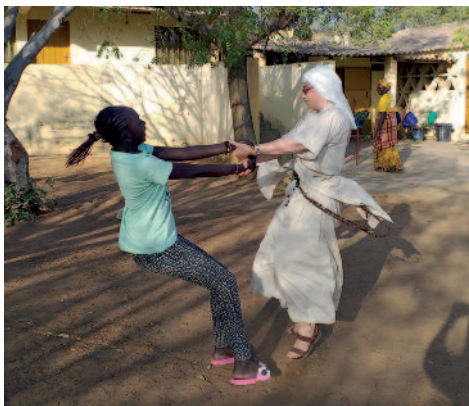
Great is their joy! The sisters are back and intend to stay.