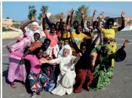
“For they shall be called children of God” (Mt 5:9): Outing with the youth group.