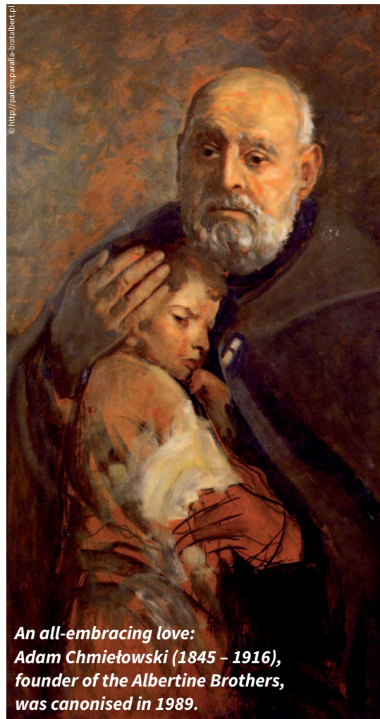
An all-embracing love: Adam Chmielowski (1845 – 1916), founder of the Albertine Brothers, was canonised in 1989.

The Albertines offer hope and food. They run shelters for the homeless, a soup kitchen for the poor, and a bakery. “No one gets to heaven alone”, their founder, Adam Chmielowski used to say. A young artist, he had initially joined the Franciscans as Brother Albert, giving overnight shelter to the needy in his own studio; then, on the advice of his confessor, he went to the homeless shelters in order to be closer to the suffering and destitute. He himself knew poverty and suffering. Aged 18, in the war against the Russians, he had lost a leg, while for the last two years of his life he suffered from stomach cancer. The four Albertines in the diocese of Kharkiv-Zaporizhzhya are the last hope for many people. This could also be said of the 45 Sisters in the nine female