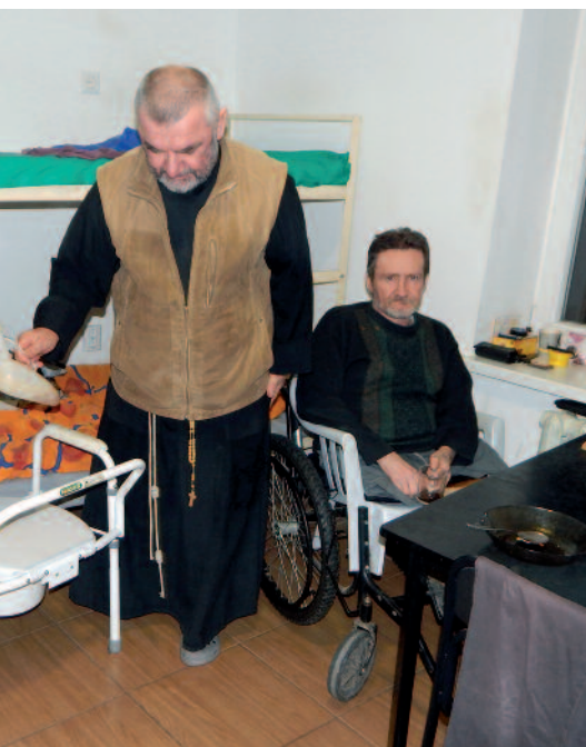
A life with meaning and dignity once more: no one is turned away by the Albertine Brothers.

Thanks to your generosity, we are able to help both the Albertine Brothers and the religious Sisters in the diocese with basic support (£20,900), so that their light can continue to witness to the love of Christ. For all they want is to bring everybody with them into heaven. ●