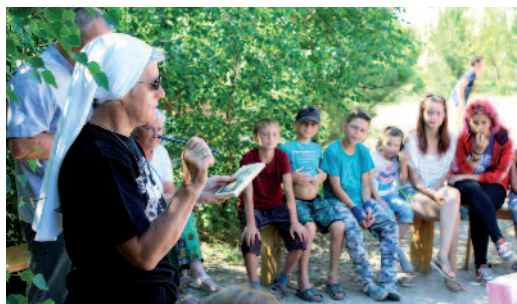
So much starts with the Sisters: youth work in a summer camp.