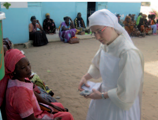
“Heal the sick” (Mt 10:8): Saint Dominic’s dispensary and healthcare centre.

the other aspects of their charism, namely prayer, communal life and evangelisation. The hope is that children and young people in particular will be able to spend time here in peace and in quiet retreat. One wing of the convent will be reserved for the Sisters, while another will be for volunteer workers at the clinic. It is a difficult venture, and they need our help. They are asking for £25,600 and entrusting everything to the Immaculate Heart of Mary, who has never yet failed them. ●