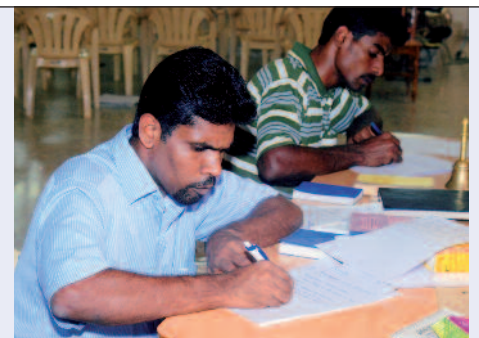
Love seeking understanding: studying in the service of the poor.

This unconditional love of Christ has led to