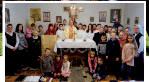
The mission starts small: Mass in a house chapel.

For me as a missionary it has always been a great joy, and indeed a great consolation, to see how close the loving bond is between the Sisters and the ordinary people. It is a particular kind of relationship or, as my babushka would have said, a ‘reciprocal