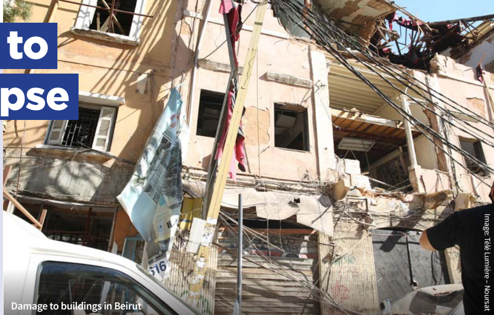
Damage to buildings in Beirut