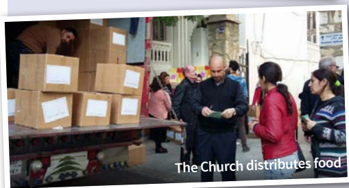
The Church distributes food

With the country's economic crisis and the coronavirus, Lebanon has been dependent on international aid – please help us continue to support our Church partners ministering to those still suffering. 🙏