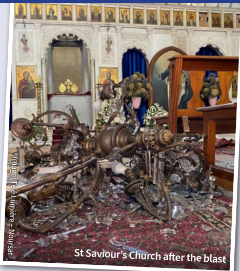
St Saviour's Church after the blast