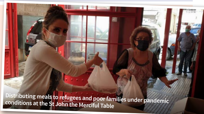
Distributing meals to refugees and poor families under pandemic conditions at the St John the Merciful Table

The ACN-backed Saint John the Merciful Table – a restaurant feeding refugees