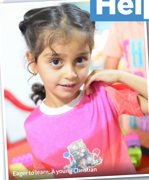
Eager to learn: A young Christian

DESECRATED, bomb-blasted and abandoned, Batnaya was one of the Christian villages in the Nineveh Plains worst affected by violence and extremism... But even here hope is rising from the ashes of persecution.