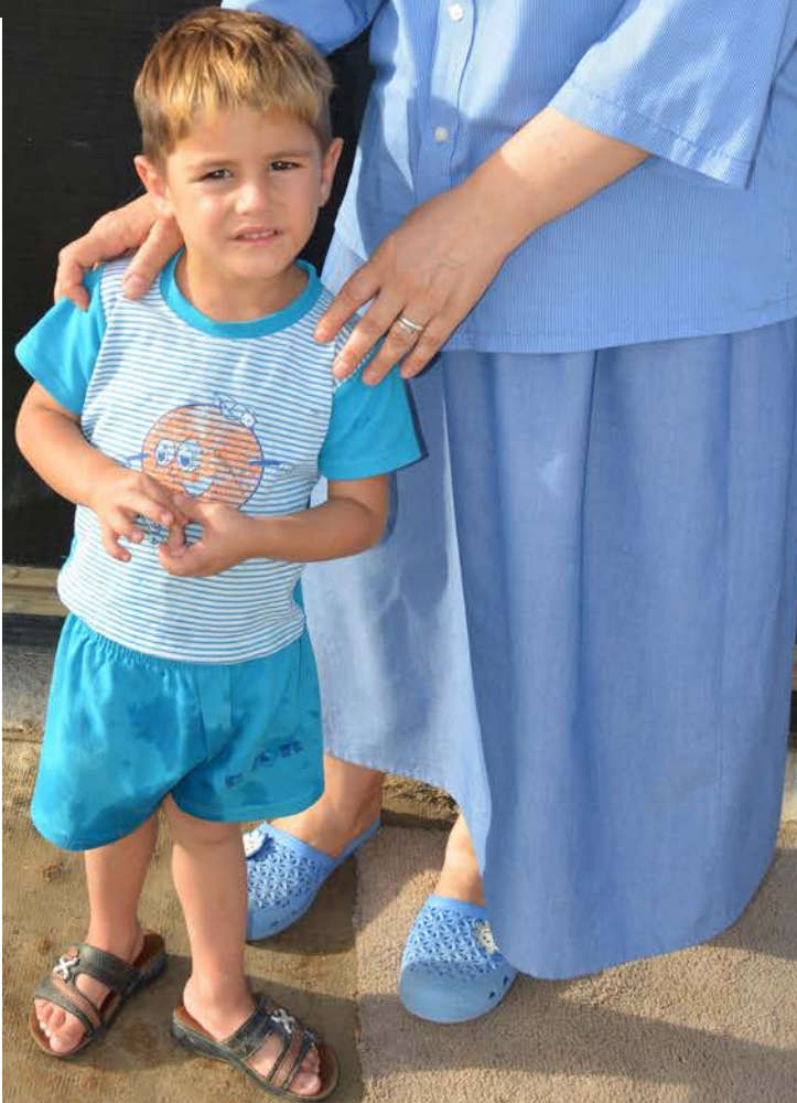
Miracle of Charity: In Erbil, Kurdish northern Iraq, Sisters take care of a young boy at a displacement camp for families who have escaped Daesh (ISIS) militants