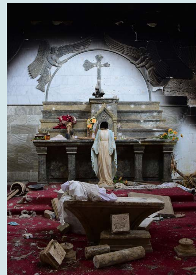
Desecrated: St Addai’s Chaldean Church, Karmlesh, in Iraq’s Nineveh Plains