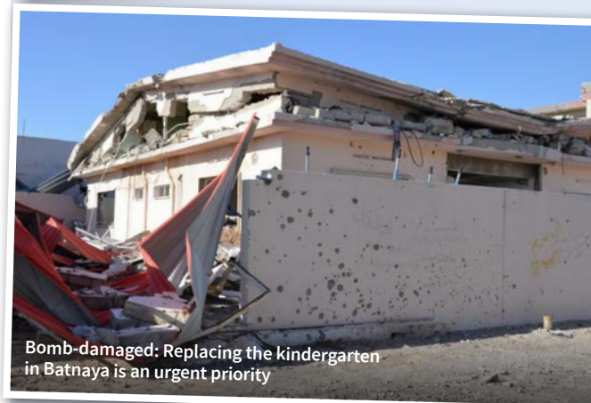
Bomb-damaged: Replacing the kindergarten in Batnaya is an urgent priority