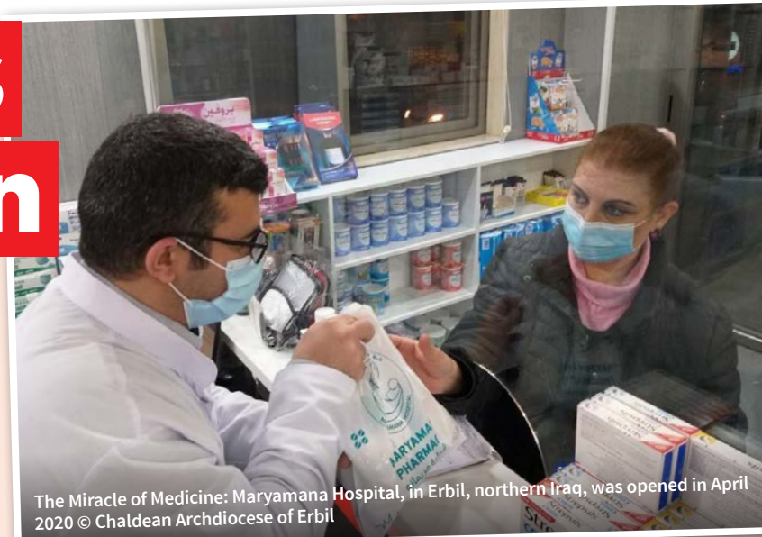
The Miracle of Medicine: Maryama Hospital, in Erbil, northern Iraq, was opened in April 2020

“The community and IDPs [internally displaced people] look to us to help them,” he added. “We need a constant supply of oxygen which is the most vital tool against the virus.”