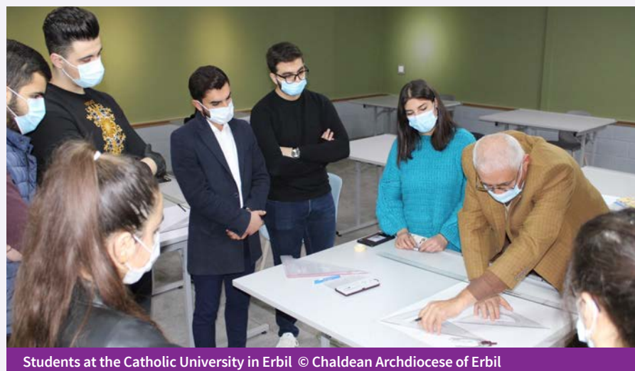
Students at the Catholic University in Erbil

ACN has prioritised help to support young Christians unable to afford education.