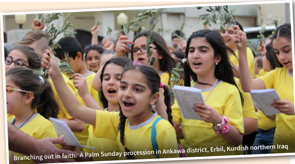
Branching out in faith: A Palm Sunday procession in Ankawa district, Erbil, Kurdish northern Iraq