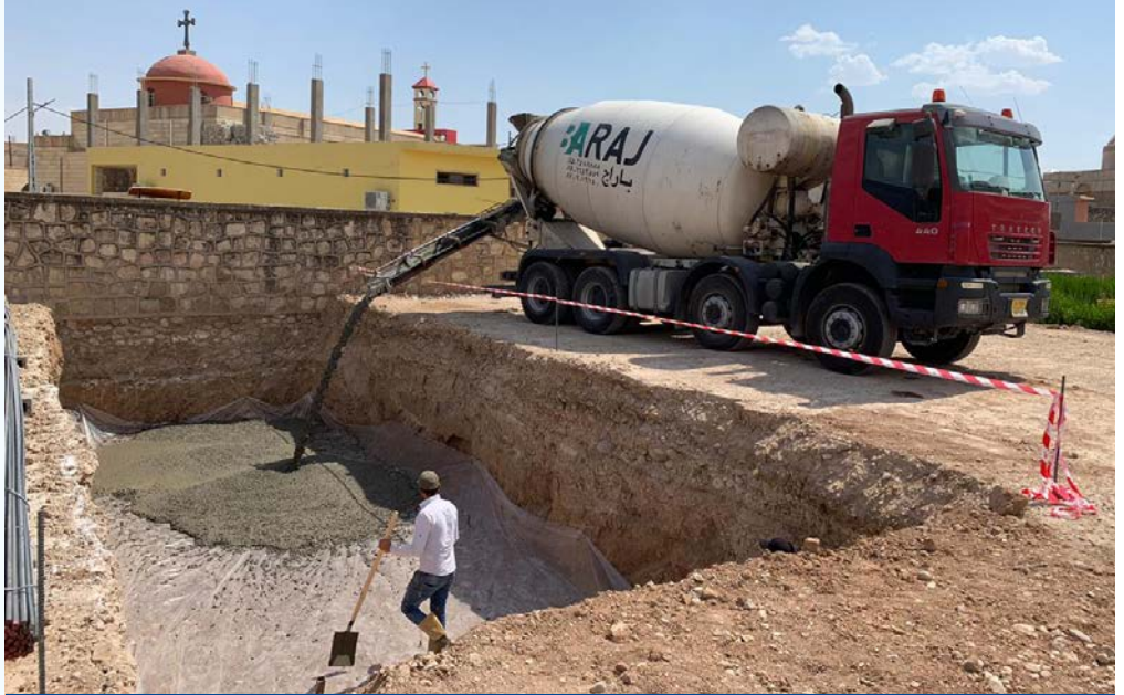
Build to stay: Work gets underway next to a church in the Nineveh Plains

It is one of many parish centres ACN has