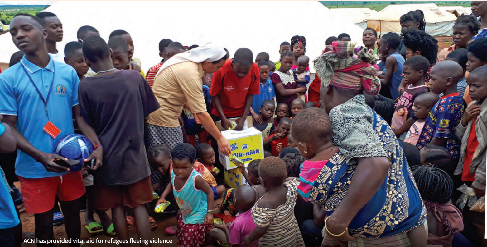
ACN has provided vital aid for refugees fleeing violence

Through your generosity, ACN can help the Church minister to those in desperate need. 🙏