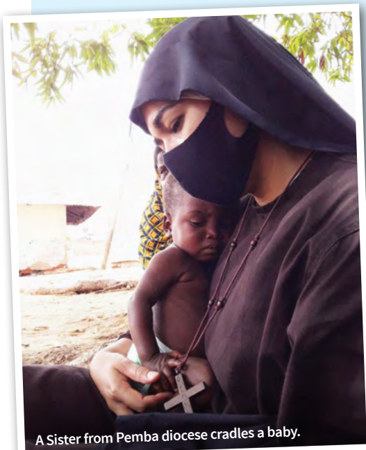
A Sister from Pemba diocese cradles a baby.

ACN is supporting six courses, training hundreds of priests, Religious and lay pastoral workers in how to provide psychological support. 🙏