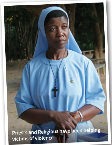
Priests and Religious have been helping victims of violence

During this time of war ACN has helped us greatly with... projects that have enabled our missionary personnel to work and bring relief to the victims of this war.”