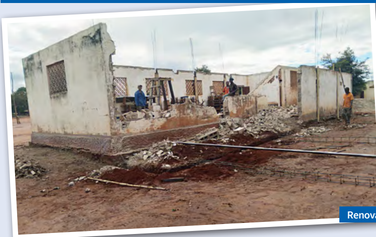
Renovation of the Church of Saint Magdalene of Netia