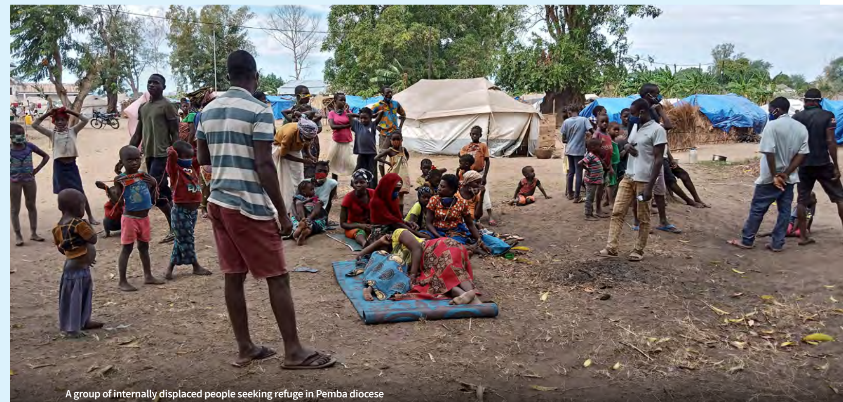
A group of internally displaced people seeking refuge in Pemba diocese