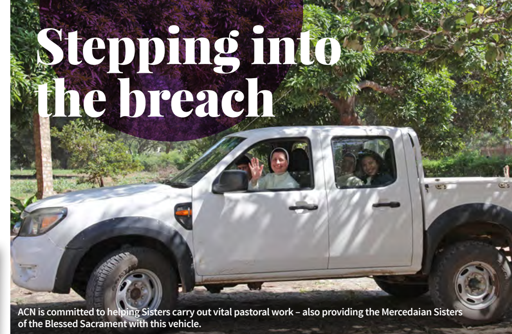
ACN is committed to helping Sisters carry out vital pastoral work – also providing the Mercedarian Sisters of the Blessed Sacrament with this vehicle.

Since 2015, there has been no priest in the parish of Our Lady of Mount Carmel in the district of Metuge, Pemba. The parish consists of more than 83,000 people.