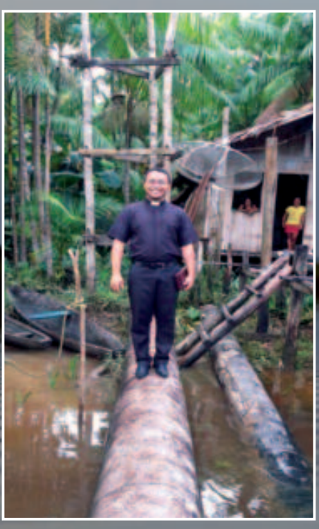
No fear of the unexpected: navigating the jungle in Christ's name.