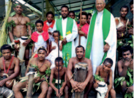
Even in faraway Papua New Guinea, Mass is celebrated for your intentions.

wine for the celebration of the Eucharist. They also enable me to visit one of the ten communities under my care each month." He and his 18 fellow priests in Alotau-Sideia Diocese can count on us providing £12,900 in stipends to support them this year.