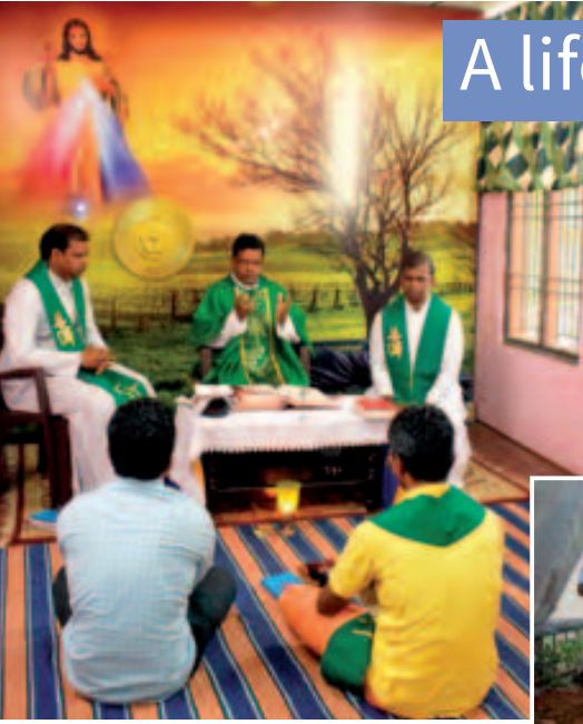
"Body of Christ, save me": sheltered by the Sacrifice of Christ, even in a pandemic.

Priests working as teachers in seminaries also rely on your Mass offerings are these . Most of them receive little – if any – remuneration for their work. They don't have time for parish work, since the formation of these future priests demands care and dedication, so they don't get stipends from there. That is why we are helping thousands of seminary teachers, including those in three major seminaries in Ghana , who have been working throughout the pandemic. "Despite COVID-19, our seminaries are able to continue as before, while observing strict hygiene measures. God has been so good to us", writes the rector of Saint Victor's seminary in Tamale. We are giving £16,500 to support 17 seminary teachers, so that they can devote themselves unreservedly to their most important task – forming young seminarians in the love which comes from the Heart of Jesus.