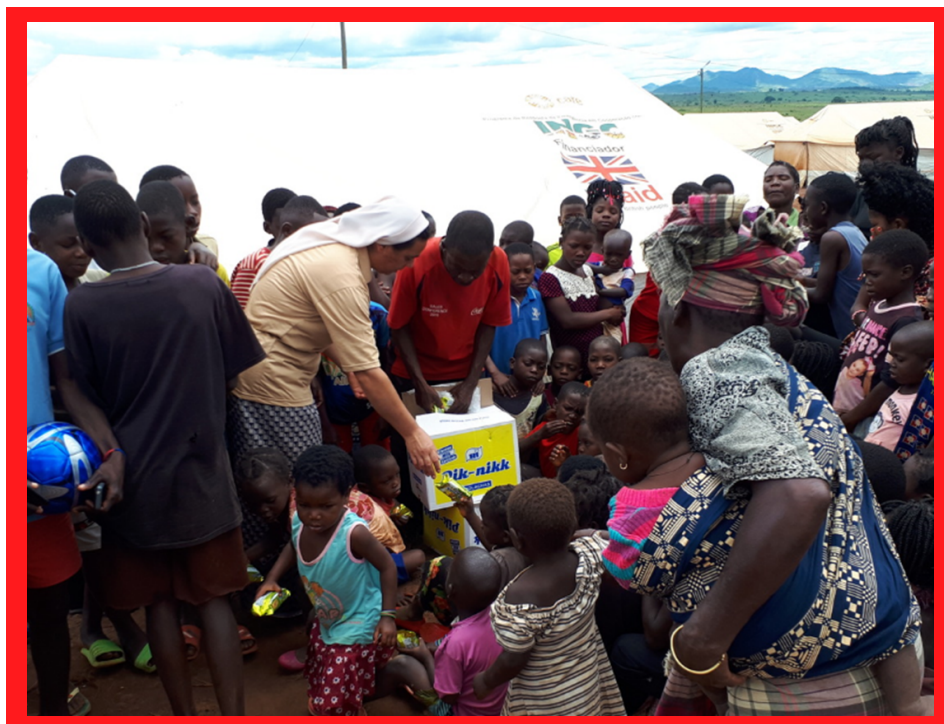
Victims of the violence in Cabo Delgado at a camp for displaced people in Lichinga, in the province of Niassa.

"They are people with nothing, who depend entirely on solidarity. They're empty-handed people".