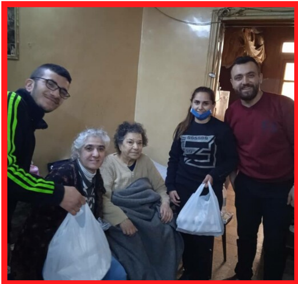
Recipients of the 'Meals on Wheels' project in Aleppo, Syria, supported by ACN.

The high and rising costs of rent, medicine and food have left many households unable to cover their basic costs. Now nine out of ten Syrians do not have enough money to buy the food and clothing they need and to pay for somewhere to live. The effect of the war on the local Christian community has been immense. Today Christians comprise around 3.6% of the Syrian population, down from 10% before 2011.