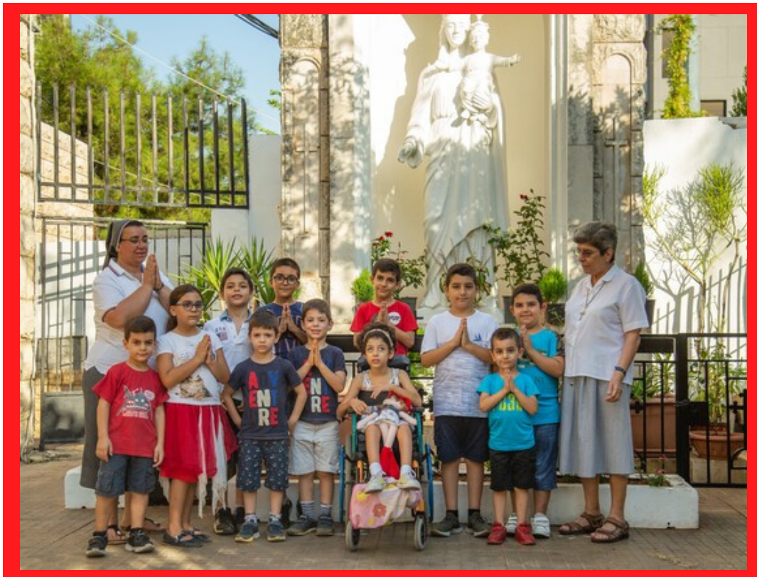
The Sisters of the congregation of Jesus & Mary are helping Christian families in Beirut and will be giving a Christmas surprise to some of these children, whose parents are struggling otherwise due to the economic collapse.

The value of their currency has plummeted drastically, meaning that simply getting hold of the necessities of day-to-day life has become incredibly expensive. This, coupled with the Covid-19 pandemic and a huge explosion which destroyed part of the city of Beirut, has made life very difficult for the people of Lebanon.