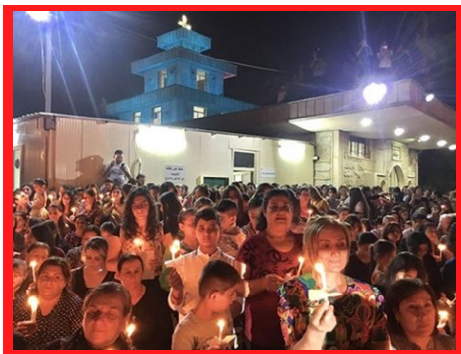
Christians celebrating and praying after the liberation of Qaraqosh, Iraq.