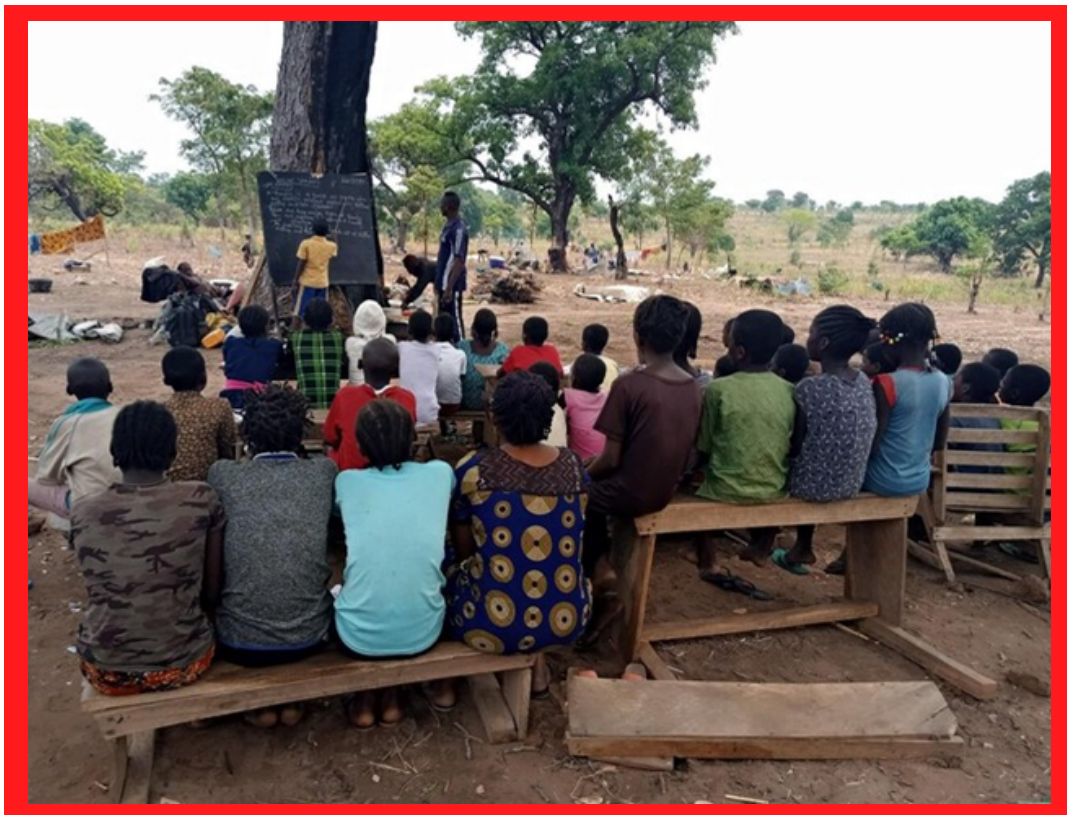
IDPs learning under trees at Ukpiam, Guma Lga of Benue.

Despite this, many stand strong in their faith.