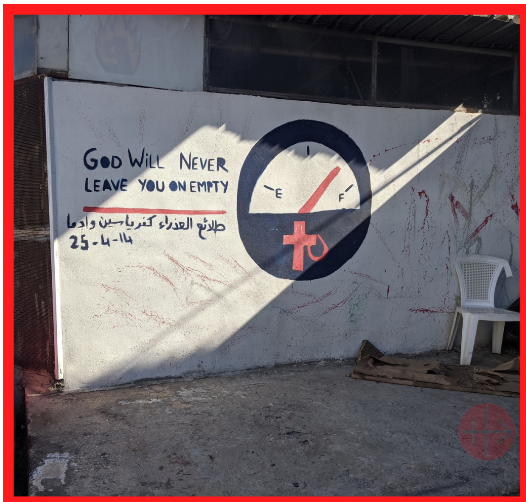
A mural on a wall in Beirut, Lebanon, with the message "God will never leave you on empty".

Today we are praying for freedom and tolerance for all religions and people of faith. We are praying for the freedom to believe in God, to practise our faith and for the religious freedom of those of other faiths and none. We pray for peace in our world, especially in places where it may be difficult for people to practise their faith. We pray that our world may become somewhere where all faiths are respected. We pray especially for those who live in places where they may be hurt or killed for their religious beliefs. As we get closer to #RedWednesday, we pray for the strength and courage to speak up for those who are discriminated against for their faith.