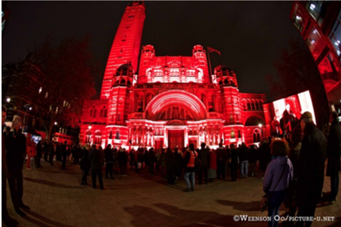
Westminster Cathedral lit up red on #RedWednesday 2016.

Please do join in solidarity on #RedWednesday (November 24th) with all the people around the world who suffer as a result of their faith.