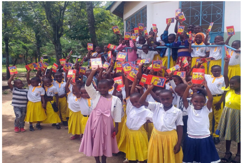
Children in the Diocese of Musoma, Tanzania, receive copies of 'God Speaks to His Children', the ACN Child's Bible.

Pray together: x1 Our Father, x1 Hail Mary, x1 Glory Be and add any personal intentions.