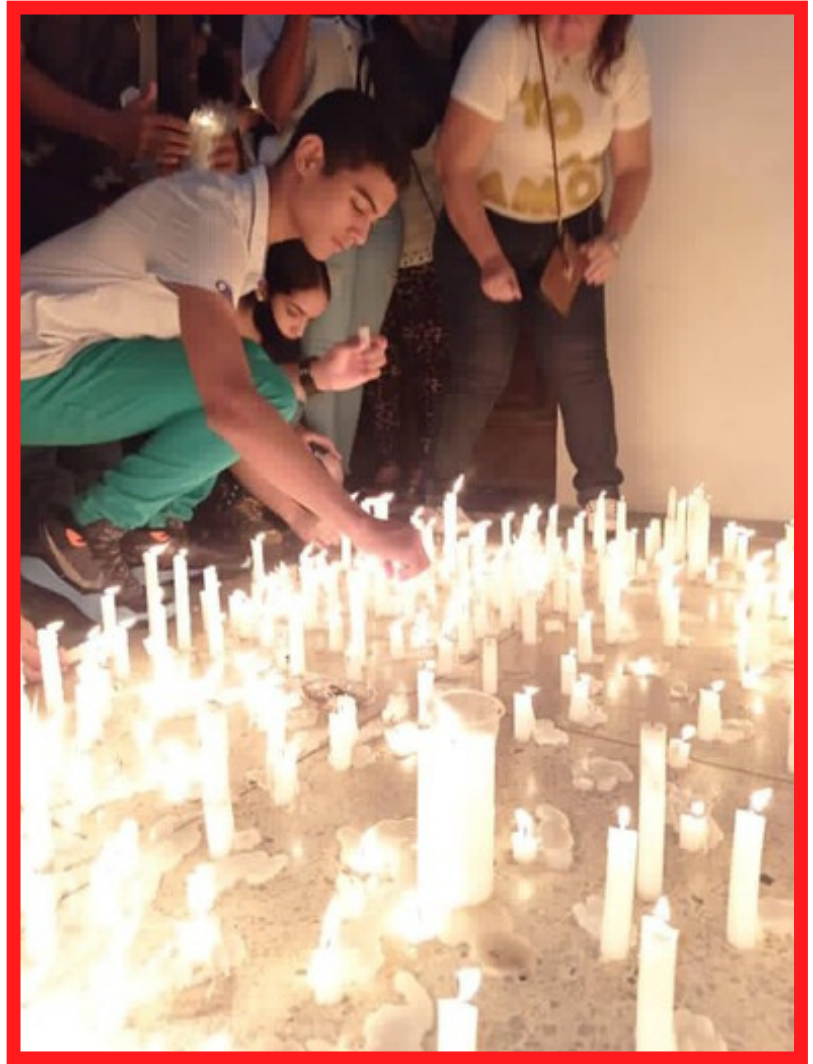
People lighting candles for the deceased in Venezuela.

In the month of November, we remember those who have passed away. Today we pray for people across the world who have been hurt or killed as a result of war, fighting, persecution or natural disasters. We pray too for those mourning their loss. God, please come to the aid of those who are bereaved, and give them the strength and courage to keep going. We remember also our loved ones who are no longer here on earth with us. May you grant them eternal peace, Lord.