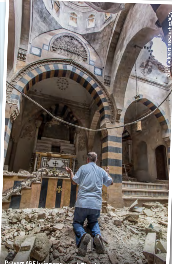
Prayers ARE being answered: Thanks to you, churches in Aleppo vital for prayer and worship, are being repaired.

"Our desire to stay is a mission. "On behalf of the parishioners and myself, we wholeheartedly thank each of you at ACN who have contributed with faith and generosity to this dream of renewing the cathedral."