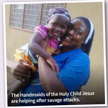
The Handmaids of the Holy Child Jesus are helping after savage attacks.

1. Food – feeding survivors who have nothing is a priority.