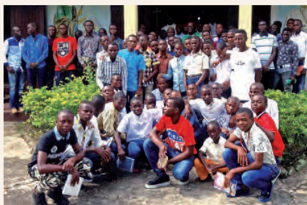
These 69 youngsters can thank their guardian angels, as they survived when the seminary was hit by the tornado.

We are hoping to help the seminary for this year with £700 per student. Will you help us, so that none of these vocations will be lost?