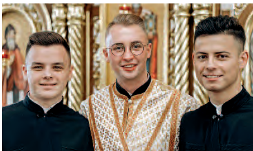
Just three of the 202 young men hoping for your help.

The history of the seminary has been an eventful one. During Soviet times it was expropriated by the Communist Party and turned into a training centre for its leadership cadres. After the collapse of communism, the by-then derelict building was returned to the Church and eventually restored with the support of ACN. The seminarians themselves rolled up their sleeves to help rebuild it. Today’s future priests are also pursuing their vocation in difficult times. Although the