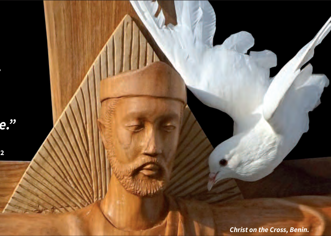
Christ on the Cross, Benin.

Pope Francis, Message to World Peace Day 2022