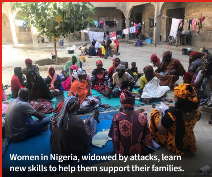
Women in Nigeria, widowed by attacks, learn new skills to help them support their families.