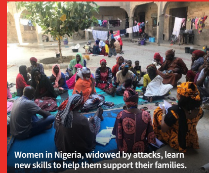
Women in Nigeria, widowed by attacks, learn new skills to help them support their families.