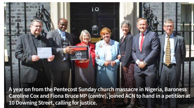
A year on from the Pentecost Sunday church massacre in Nigeria, Baroness Caroline Cox and Fiona Bruce MP (centre), joined ACN to hand in a petition at 10 Downing Street, calling for justice.

In many parts of Africa there has been an explosion of anti-Christian violence, with millions displaced and living in fear.