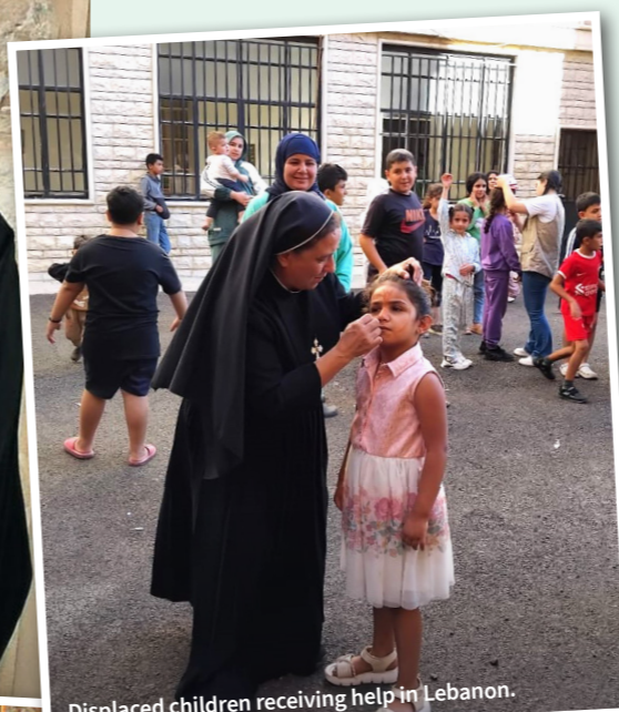
Displaced children receiving help in Lebanon.