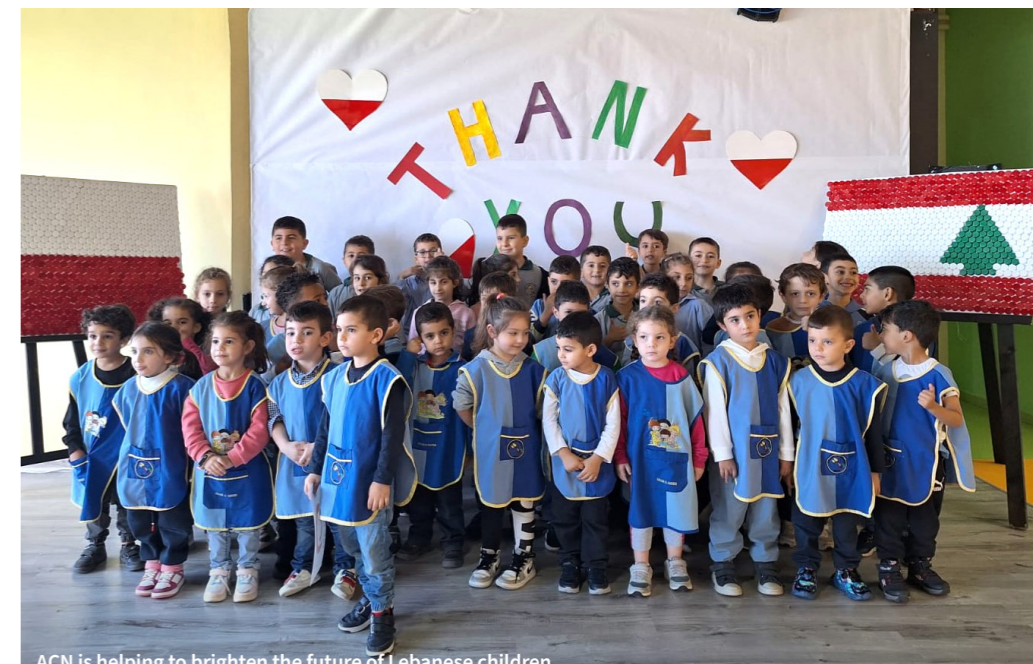
ACN is helping to brighten the future of Lebanese children.