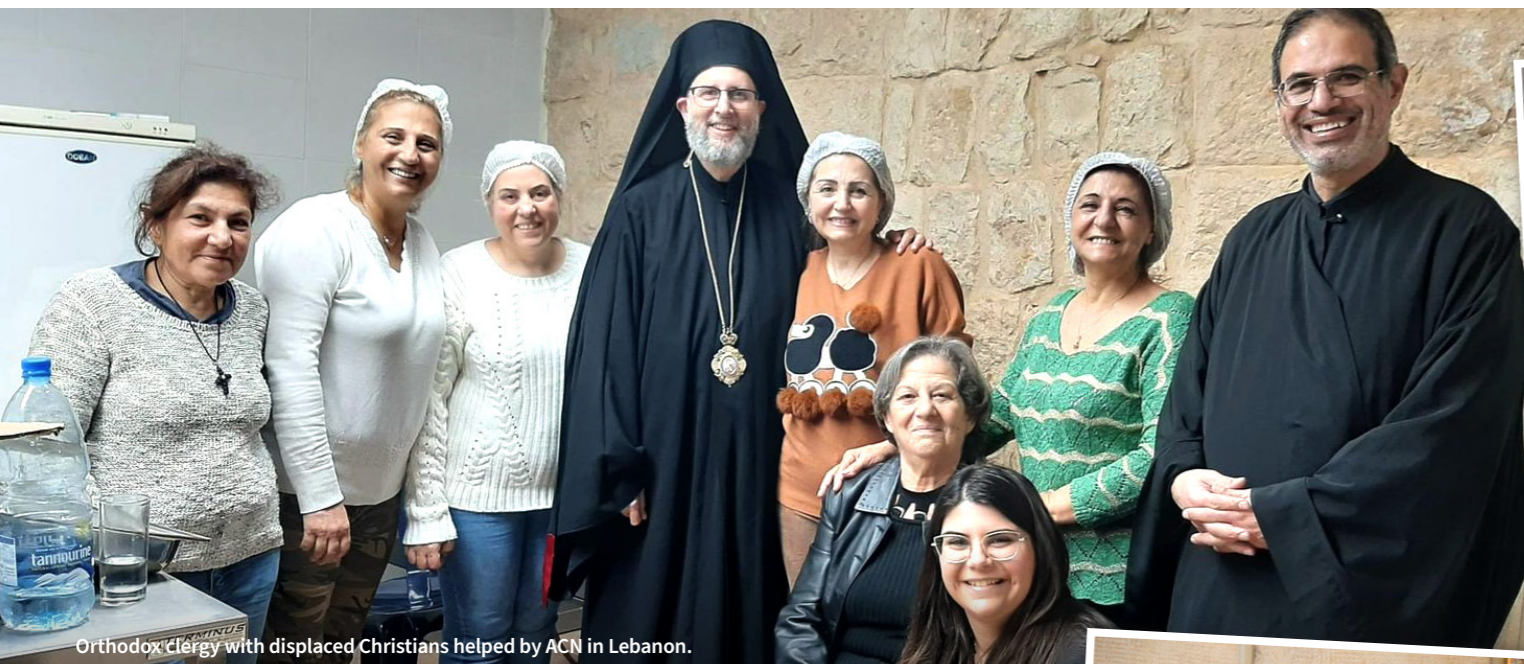
Orthodox clergy with displaced Christians helped by ACN in Lebanon.