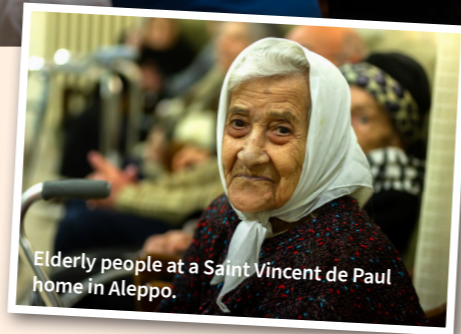
Elderly people at a Saint Vincent de Paul home in Aleppo.