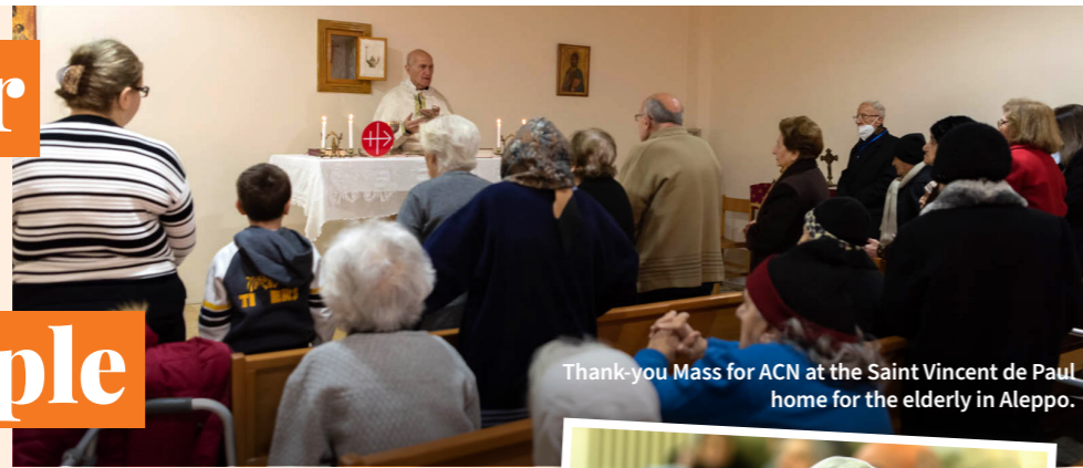
Thank-you Mass for ACN at the Saint Vincent de Paul home for the elderly in Aleppo.

Elderly people in Syria suffering extreme poverty and isolation are receiving life-saving medicine thanks to you, the friends of ACN.