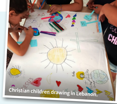
Christian children drawing in Lebanon.