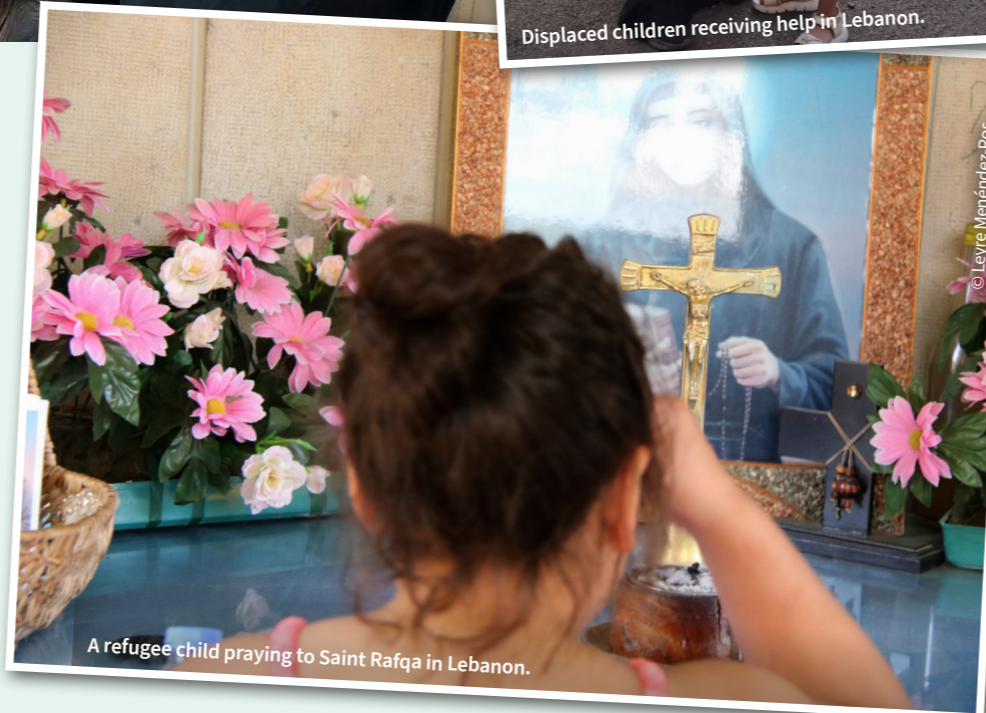
A refugee child praying to Saint Rafqa in Lebanon.

ACN is in close contact with project partners to monitor the unfolding crisis and evaluate what further help is needed. ✚