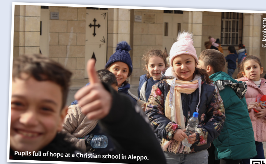
Pupils full of hope at a Christian school in Aleppo.