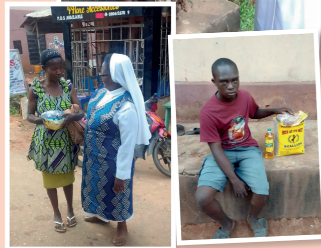
Handmaids of the Holy Child Jesus distributing aid to internally displaced persons.