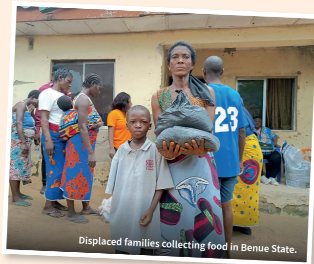
Displaced families collecting food in Benue State.