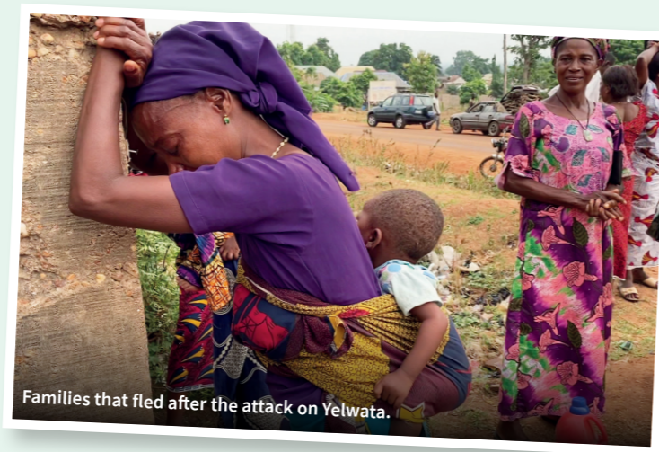
Families that fled after the attack on Yelwata.