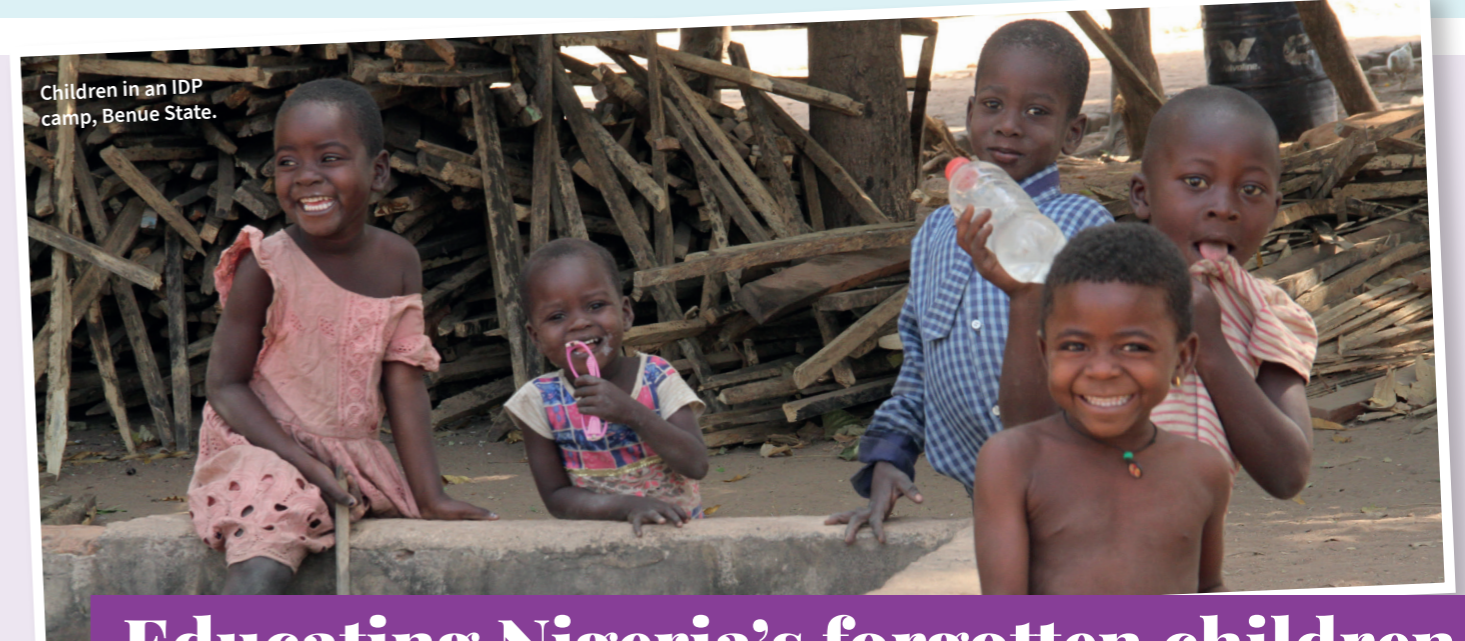
Children in an IDP camp, Benue State.

But they cannot do it alone, so they have turned to us for help – please do all you can to help our suffering brothers and sisters in Benue State. ✚