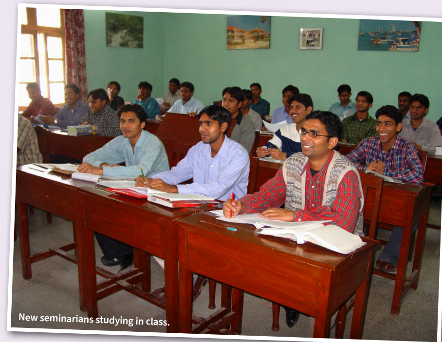
New seminarians studying in class.