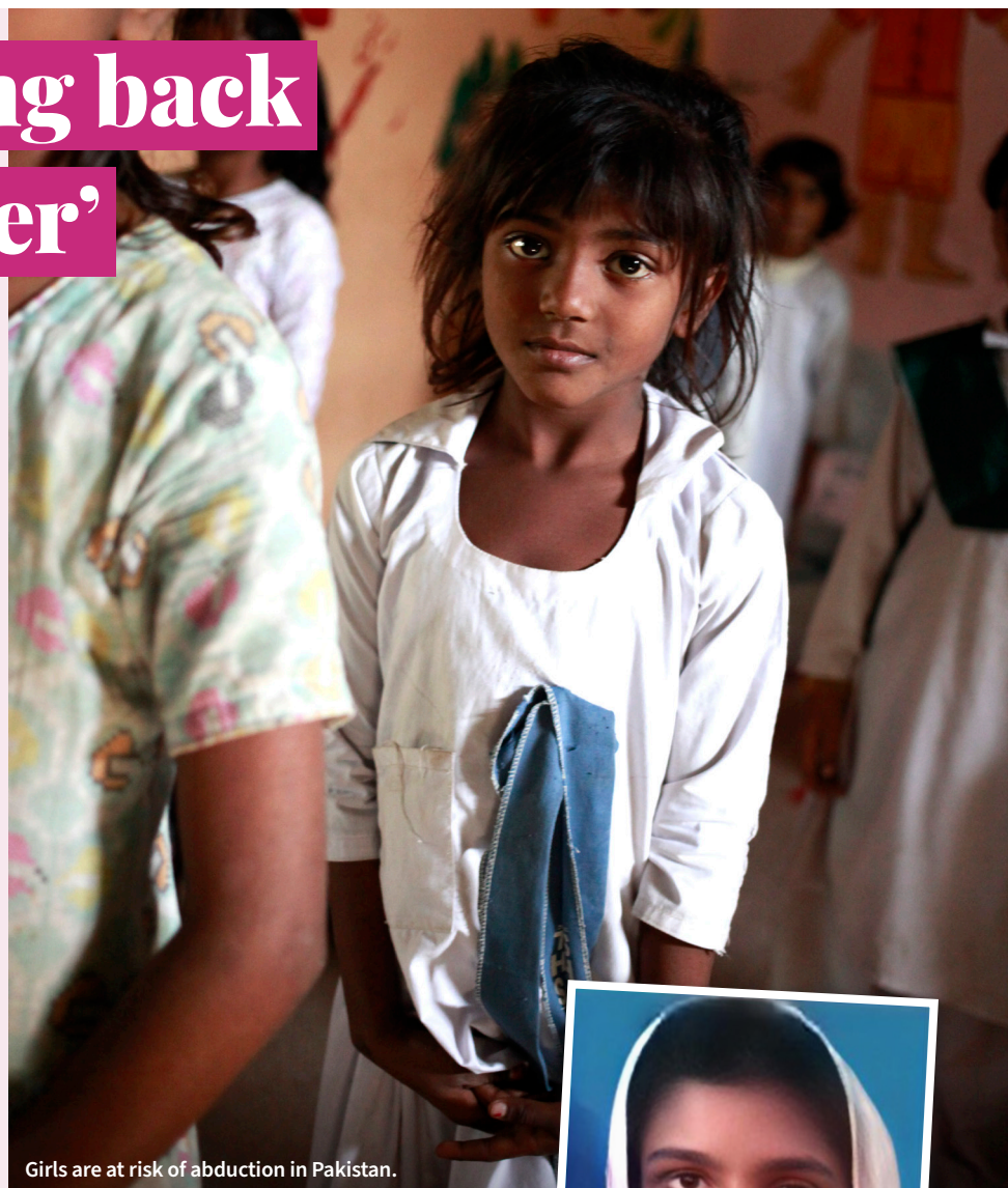
Girls are at risk of abduction in Pakistan.

The kidnapping and forced marriage of Christian girls and women is a major problem. While there is no agreement about how many cases occur each year, research suggests that every year hundreds of young women and girls from Christian, Hindu and other religious minorities are abducted and forced to convert to Islam by the men who take them from their families. As part of their