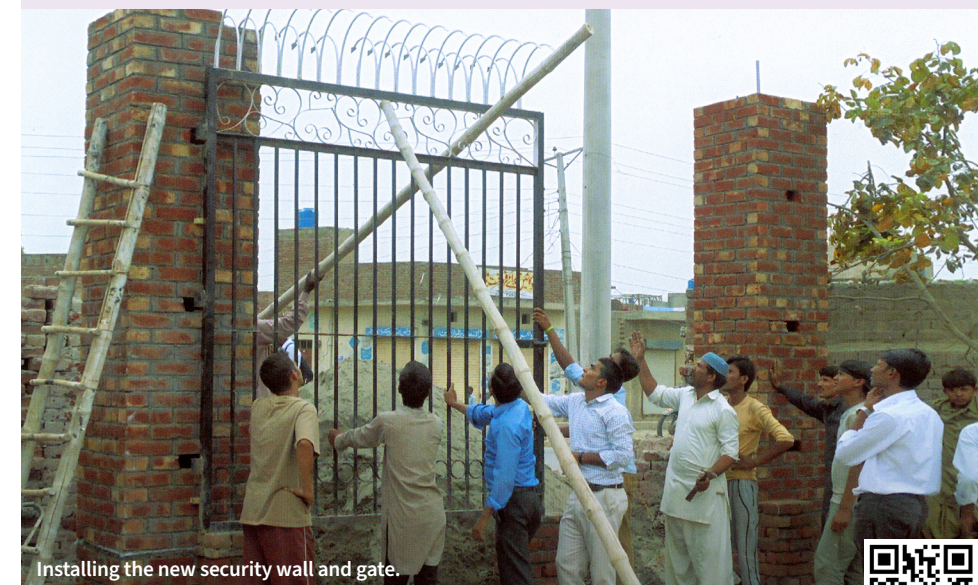
Installing the new security wall and gate.