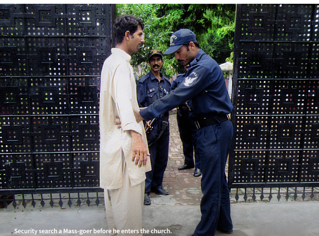
Security search a Mass-goer before he enters the church.

Without your generous love we couldn't continue standing by these courageous young men on their path to the priesthood. Thank you. 🙏